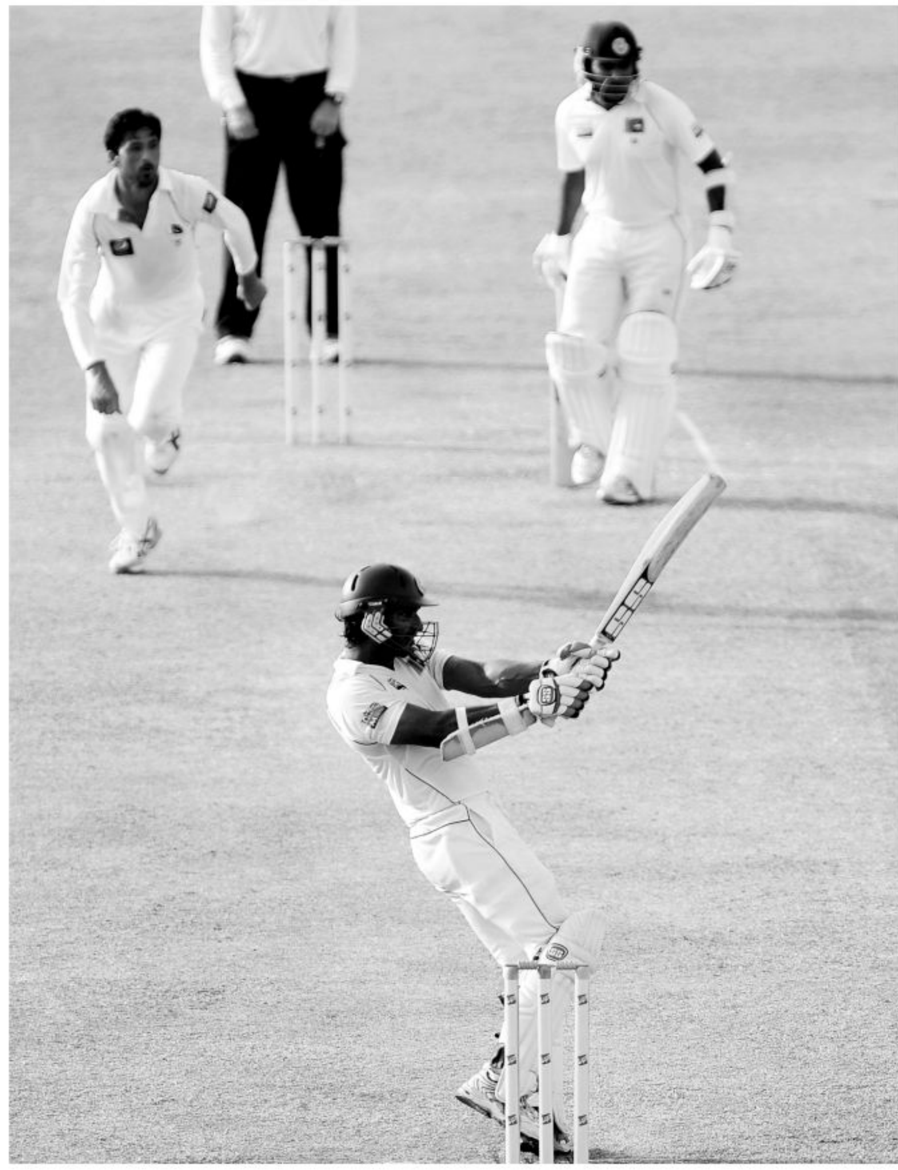
Sri Lanka's Kumar Sangakkara rocks back to play a pull shot on the fourth day of the second Test against Pakistan at the Sinhalese Sports Club in Colombo yesterday.

Featuring some of the world's largest diamonds, the Crown Jewels are used by the British monarch during coronations and other state functions. They have been kept at the tower since 1661.