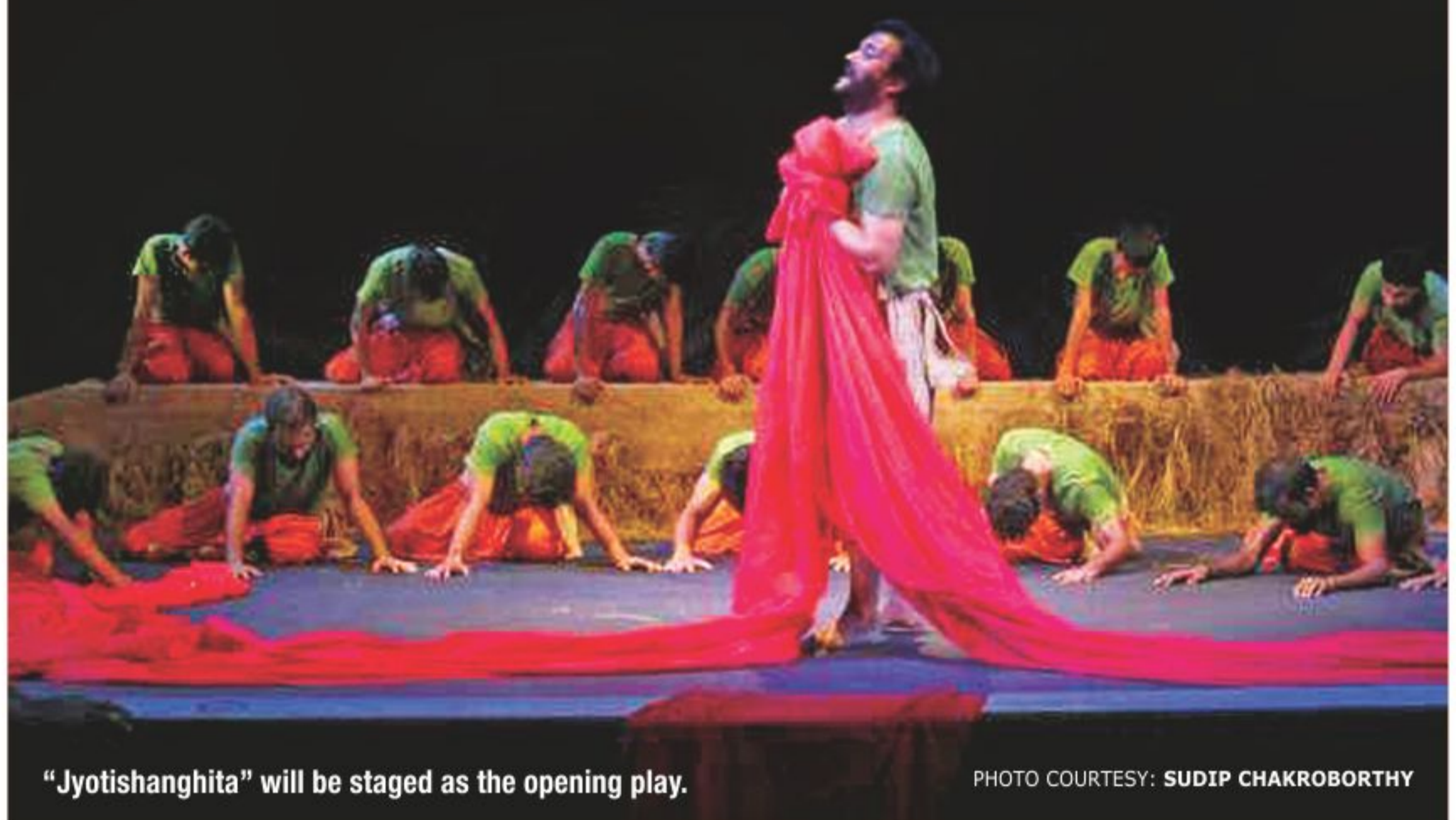
"Jyotishanghita" will be staged as the opening play.

STAFF CORRESPONDENT A two weeklong theatre festival, featuring over 100 plays based on the Liberation War, begins today at the Bangladesh Shilpakala Academy. Prime Minister Sheikh Hasina, as chief guest, is expected to inaugurate the grand festival. The inaugural ceremony will take place this afternoon at 4pm at the National Theatre Hall of the academy in Dhaka. Bangladesh Shilpakala Academy, in association with Bangladesh Group Theatre Federation, is organising the festival. Plays will be staged simultaneously at four venues -- National Theatre Hall, Experimental Theatre Hall, Studio Theatre Hall and National Music and Dance Centre Auditorium. The festival will primarily highlight the spirit of the Liberation War after four decades. Member organisations of Group Theatre Federation, wing organisations of Bangladesh Shilpakala Academy from different districts and college level theatre troupes from different parts of the country will stage plays at the festival. On the inaugural day, among other plays, "Jyotishanghita" will be staged at the National Theatre Hall at 7:30pm. The play is a Bangla-