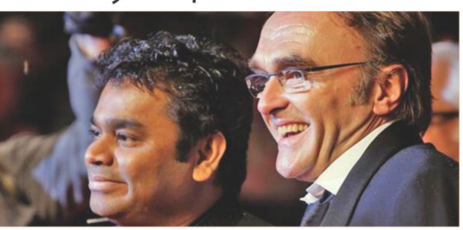
A.R. Rahman (left) and Danny Boyle.