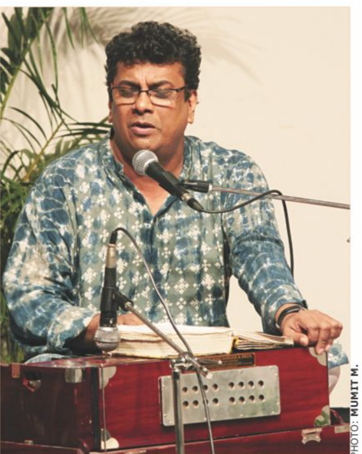
more performances from the artiste and apparently seemed satisfied with the last number performed by the singer.