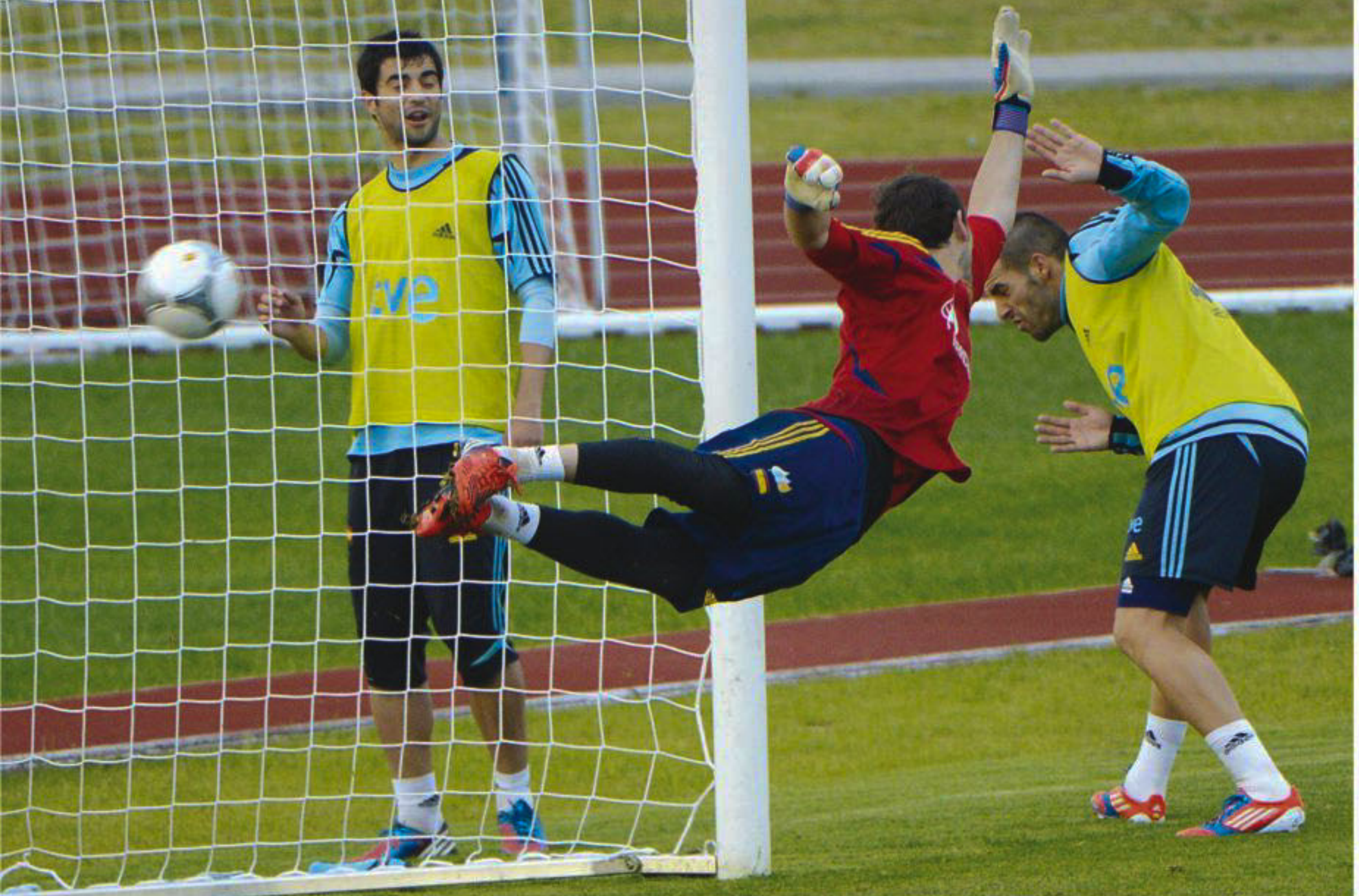
Spanish goalkeeper Iker Casillas dives for the ball during a training session in Gniewino on Wednesday.

Both Blanc and his assistant, Alain Boghossian, have played down the incident, but Florent Malouda admitted the players' comportment had "awoken some old demons". Malouda is one of 10 survivors from the French squad whose internecine quarrels were broadcast to the world by L'Equipe during the last World Cup. The revelations sent the camp into meltdown. Anelka was expelled from the squad, captain Patrice Evra promised to root out the "mole" responsible for the leak, and the players went on strike in protest at Anelka's treatment. This time around, France's players and staff have reacted very differently. Mindful of the damage liable to be caused by repeated denials, Blanc and his players have openly admitted that tempers flared following the loss to Sweden but have sought to portray the friction as a positive thing. "There were words spoken but it was the normal exchanges you get in a changing room," said Boghossian. "It would have been worse if there had been nothing."