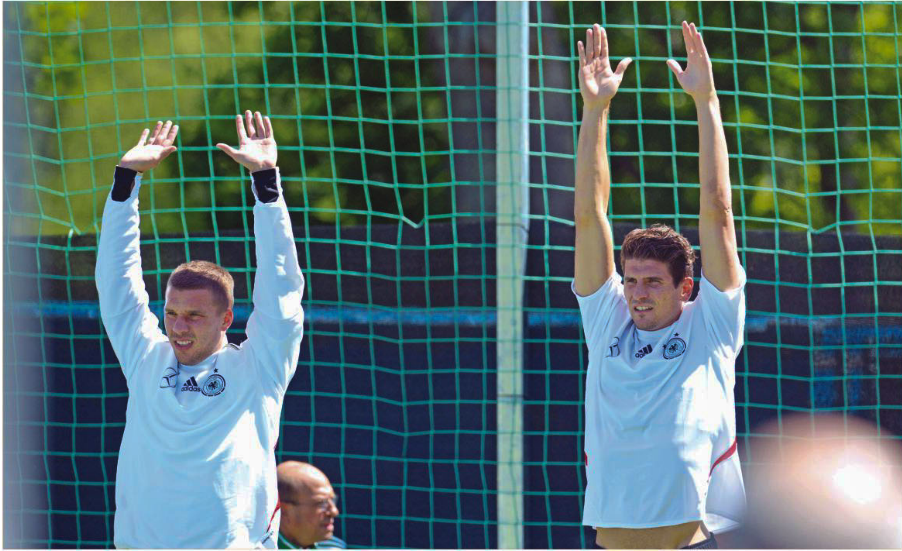
German forwards Mario Gomez (R) and Lukas Podolski warm up during a training session in Gdansk on Wednesday ahead of their Euro 2012 quarterfinal against Greece.