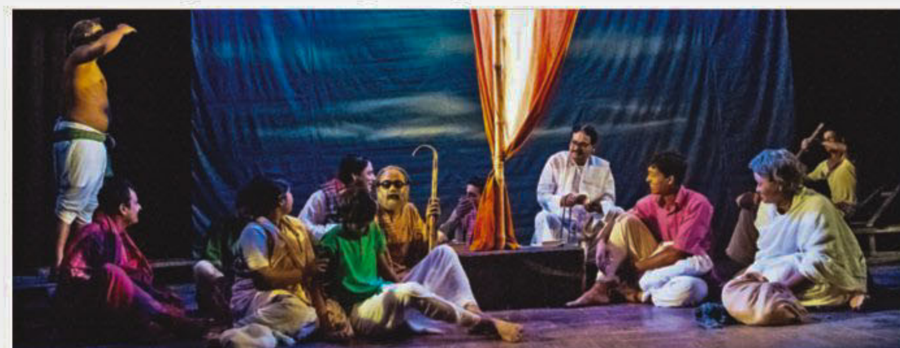
An epic voyage is the core aspect of the play.