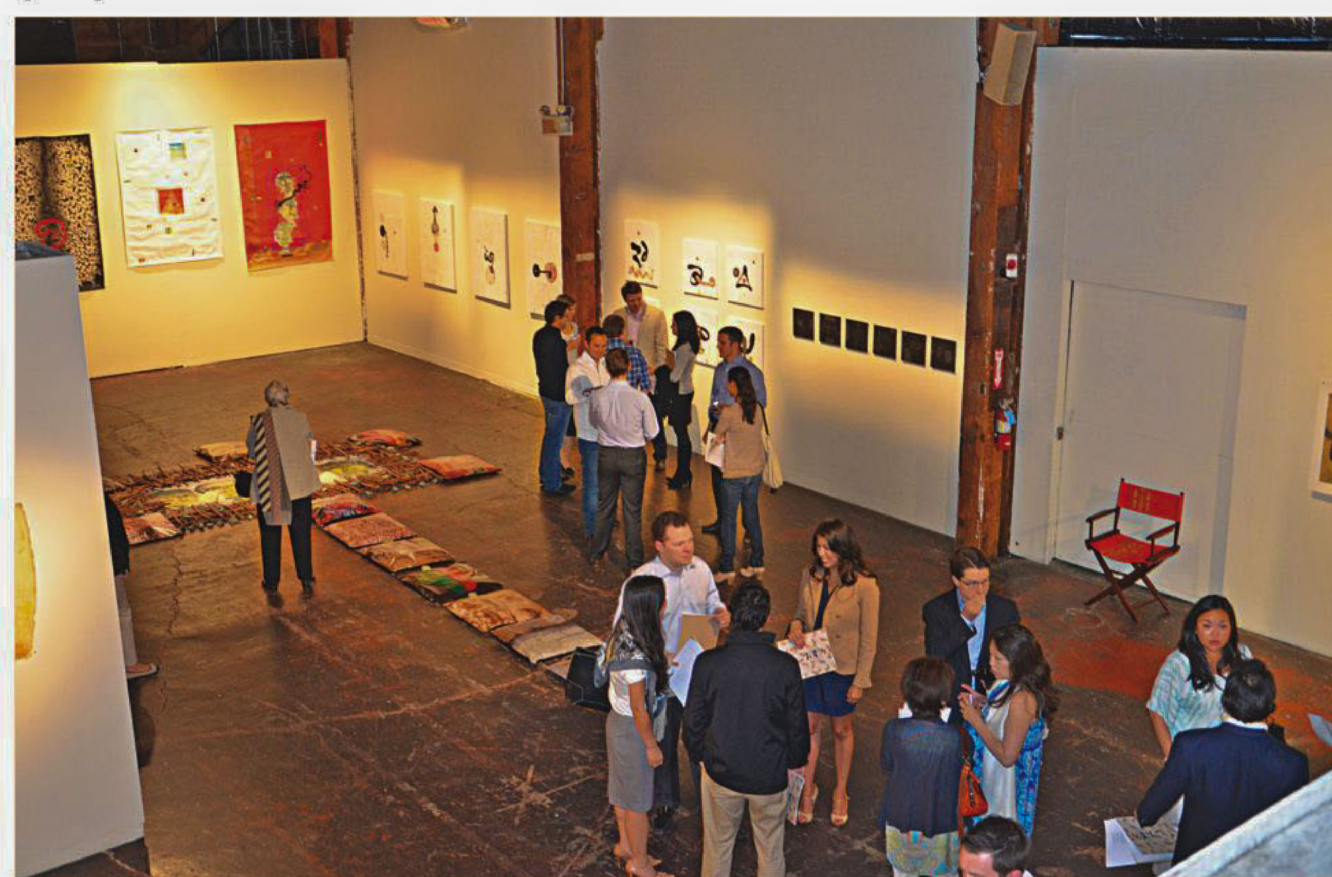
Art enthusiasts at the exhibition.