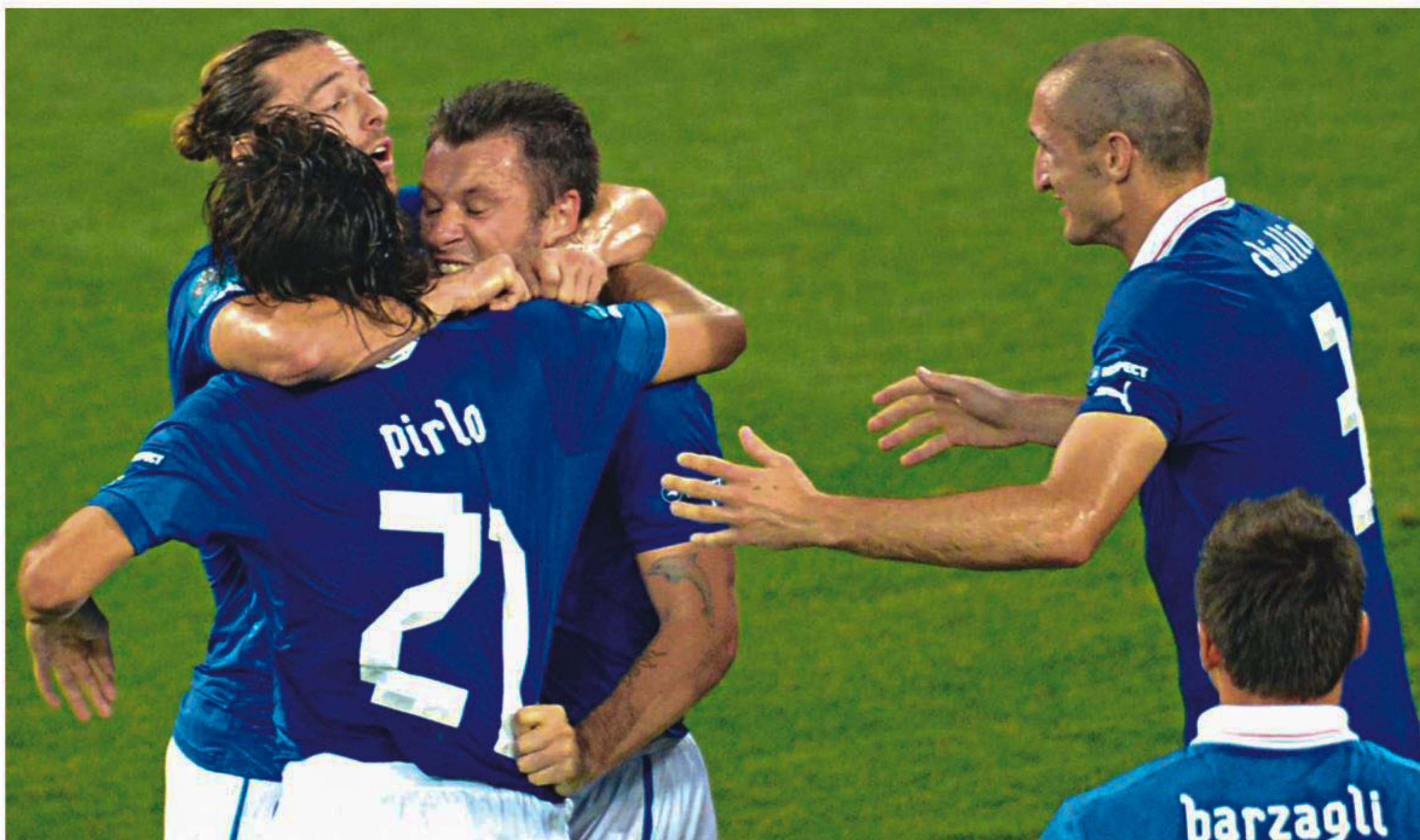
Italian forward Antonio Cassano (C) is the toast of his teammates after scoring the opening goal against Republic of Ireland during their Euro 2012 Group C match at the Municipal Stadium in Poznan last night.