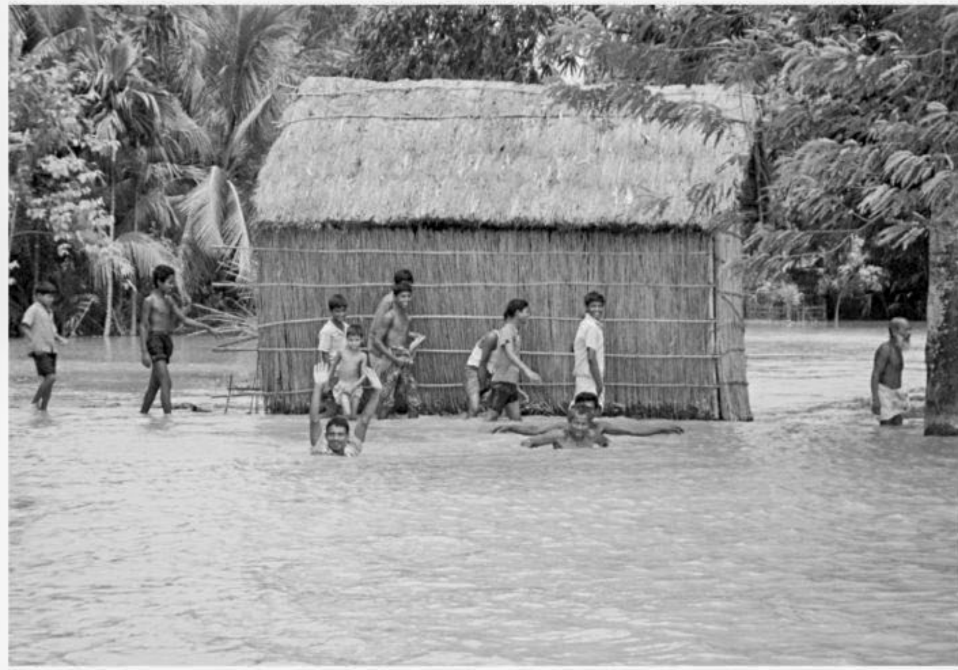
Low-lying Sindurna village in Hatibandha upazila of Lalmonirhat yesterday. Torrential rain in the last 2-3 days triggered flash flood in four upazilas of the district.

About two feet of water flooded most of the affected villages and many people have taken shelter on the embankments and government offices, they said.