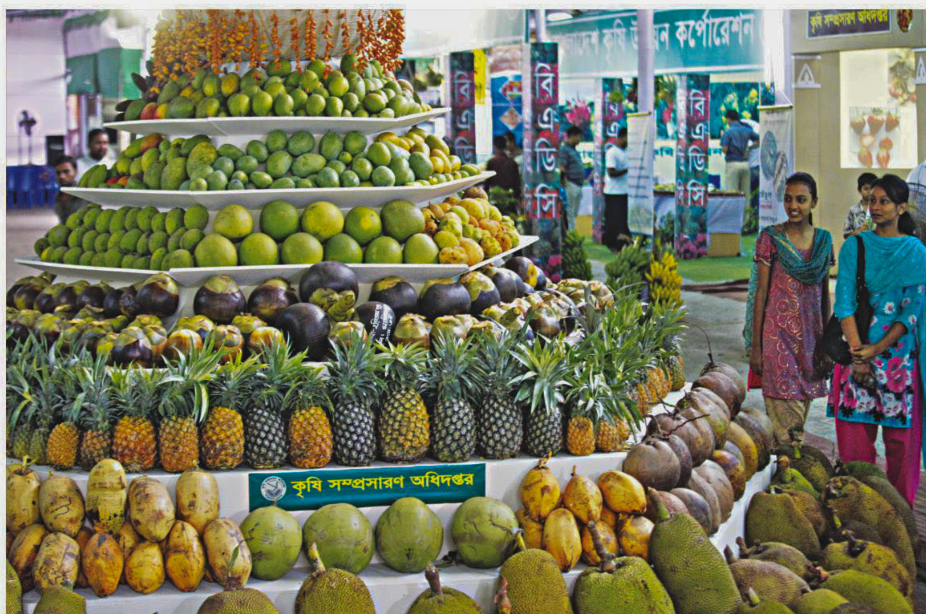
A myriad of succulent fruits, specialities of this season, on display at the end of a three-day National Fruit Exhibition 2012 at Bangladesh Agricultural Research Council in the capital yesterday.

Fruits which were not sold at the exhibition will be given away to orphanages, said one of the organisers.