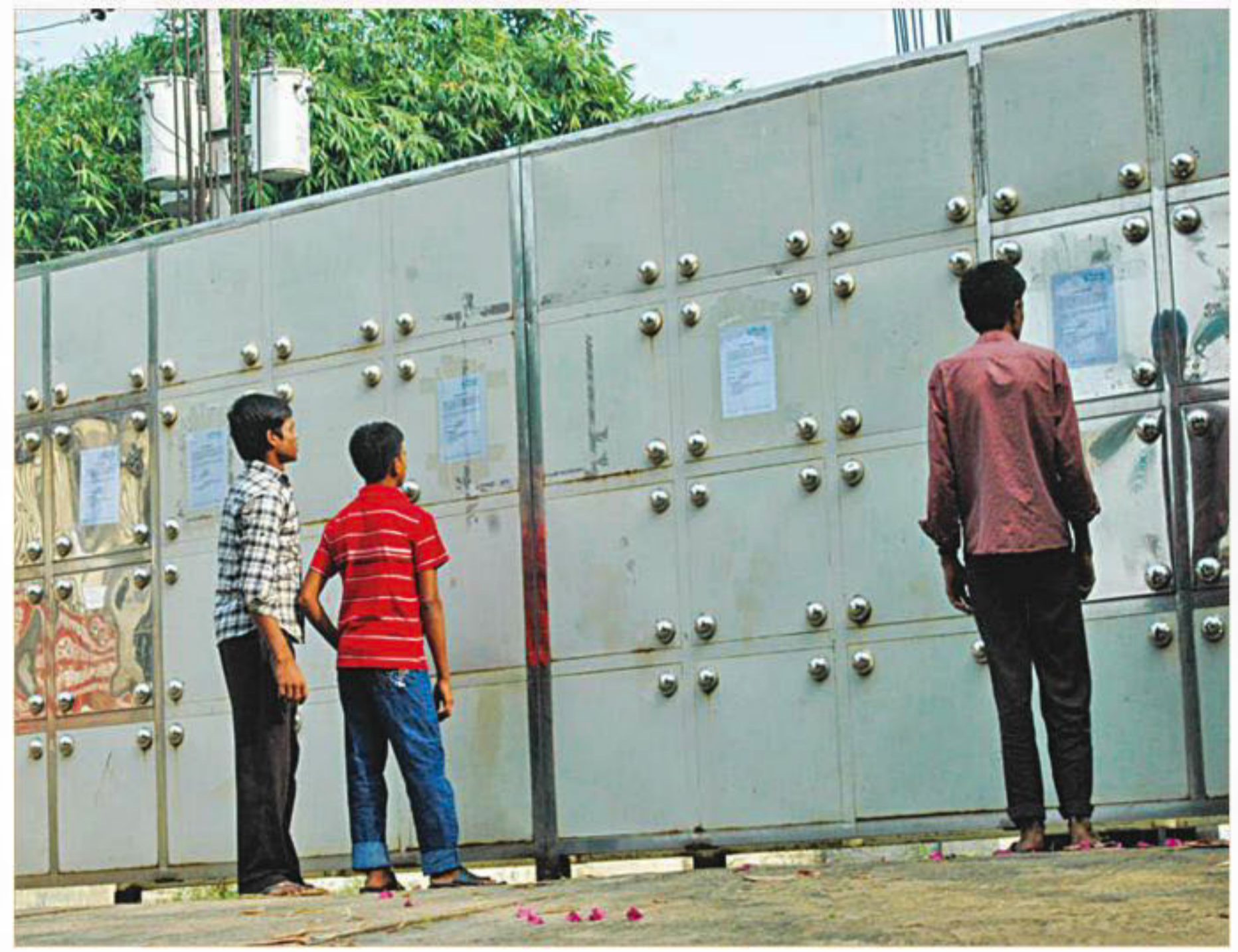
Anxious workers look for a notice on the closed gates of a garment factory at Ashulia to know when they might be able to resume work.