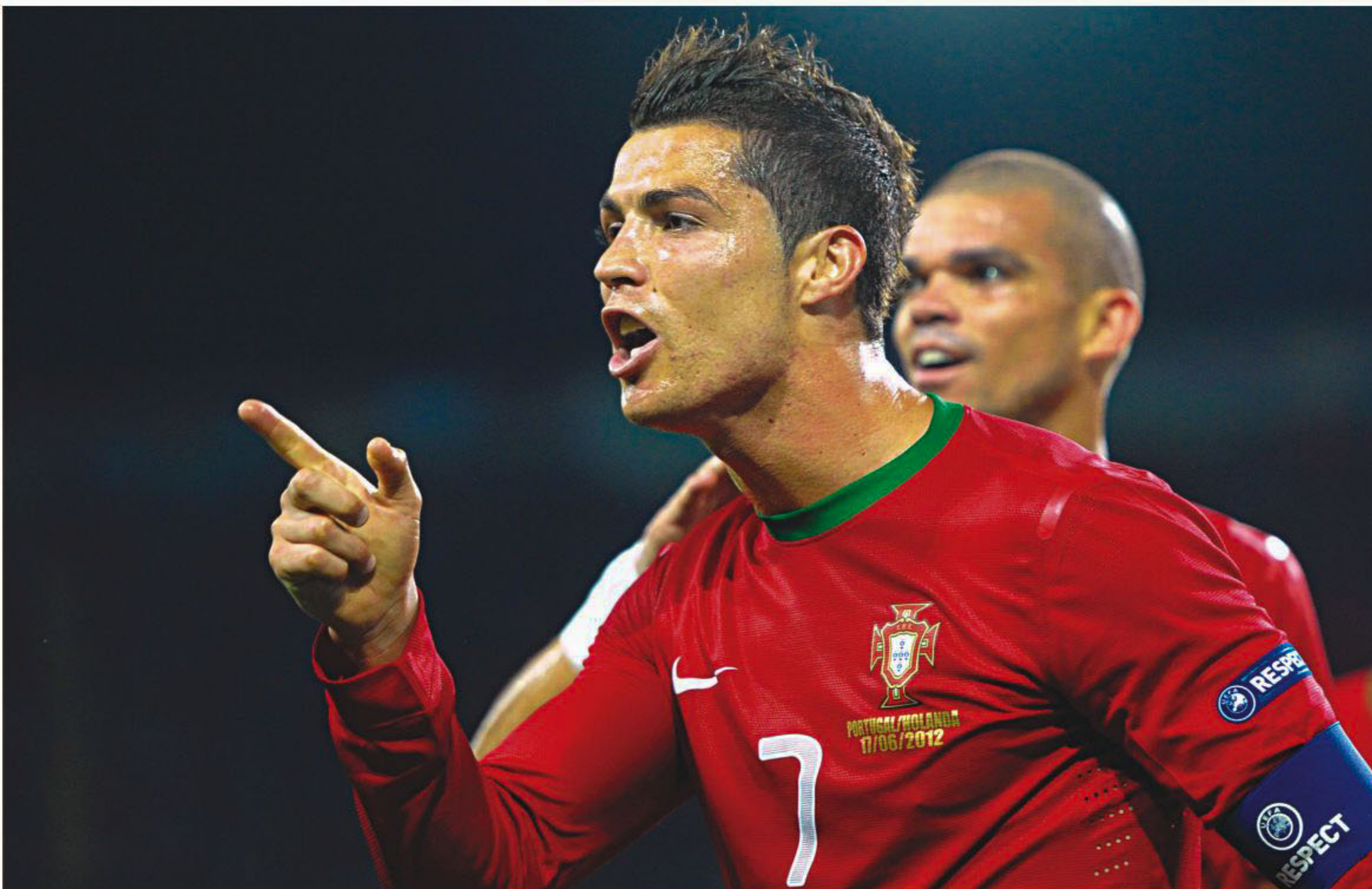
Cristiano Ronaldo hit back at his critics in the best way possible on Sunday night. Here the Portuguese striker celebrates the first of his two goals against Netherlands during their do-or-die Group B Euro 2012 match at the Metalist Stadium in Kharkiv.