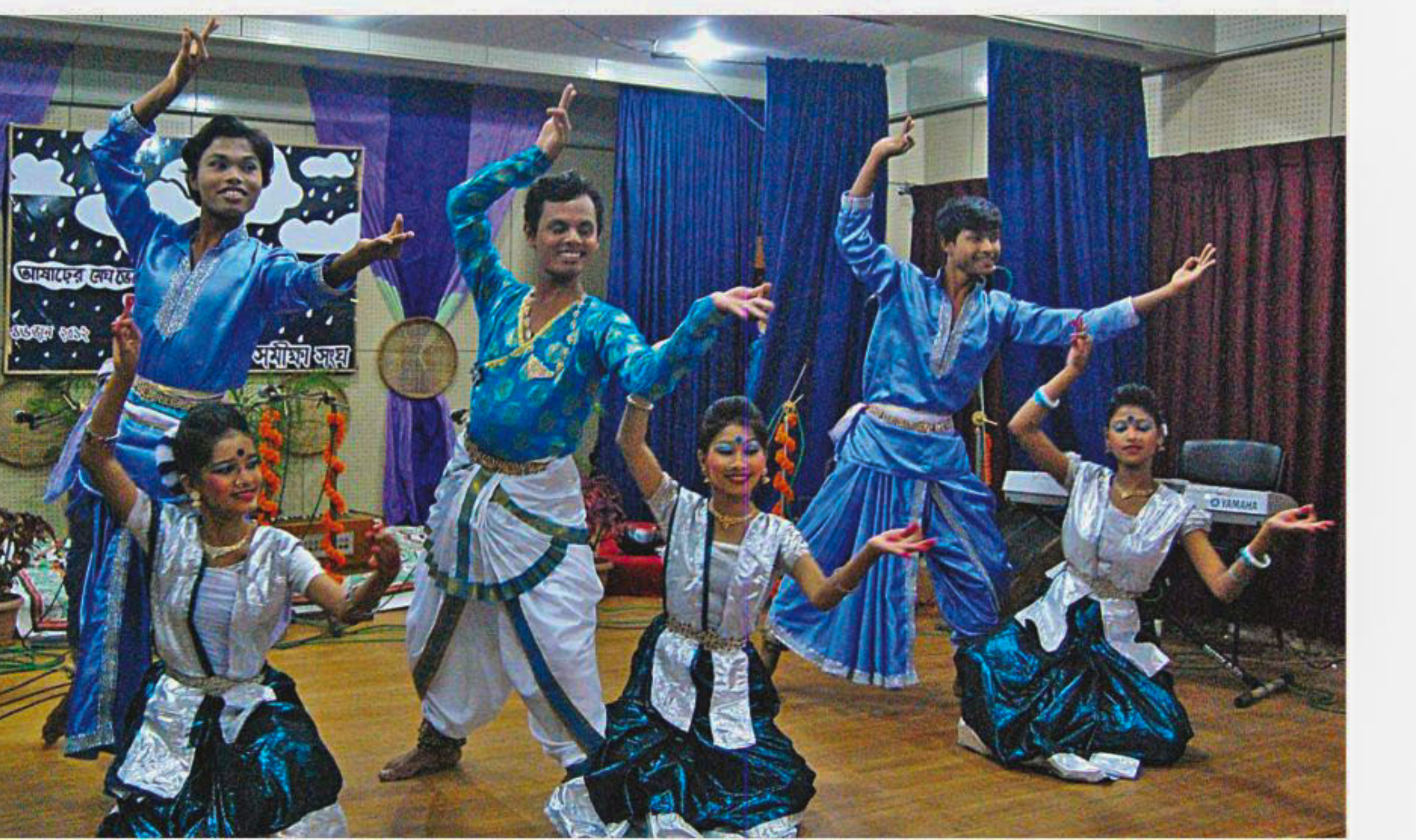
Dancers perform at the programme.