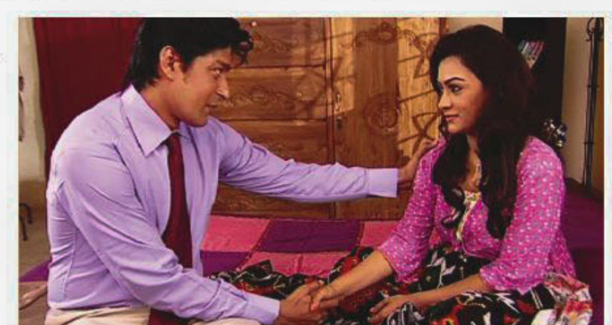
A scene from the serial.