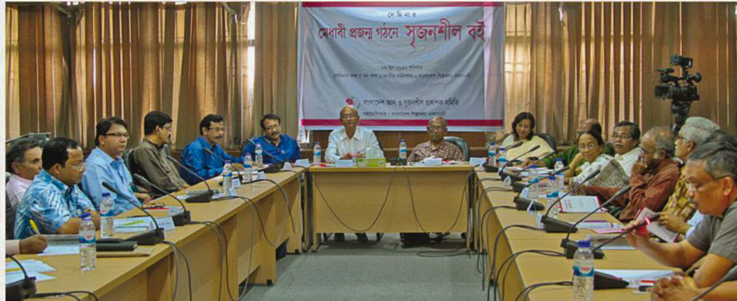
Discussants at the seminar.