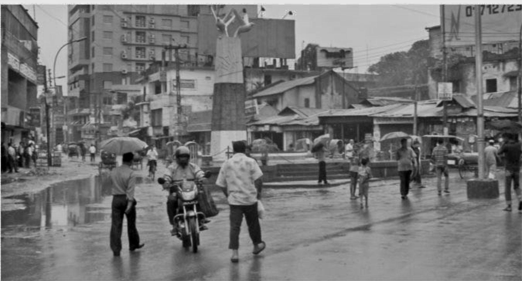
Vehicles stay off the roads in Rangpur town during BNP enforced eight-hour long hartal in the district yesterday demanding withdrawal of 'false' cases against the central leaders of the party and restoration of the caretaker government system; right, activists of BNP-led 18-party alliance block the station road near Natun Bazar in Gaibandha town as police prevent them from observing the programme on the same demands.