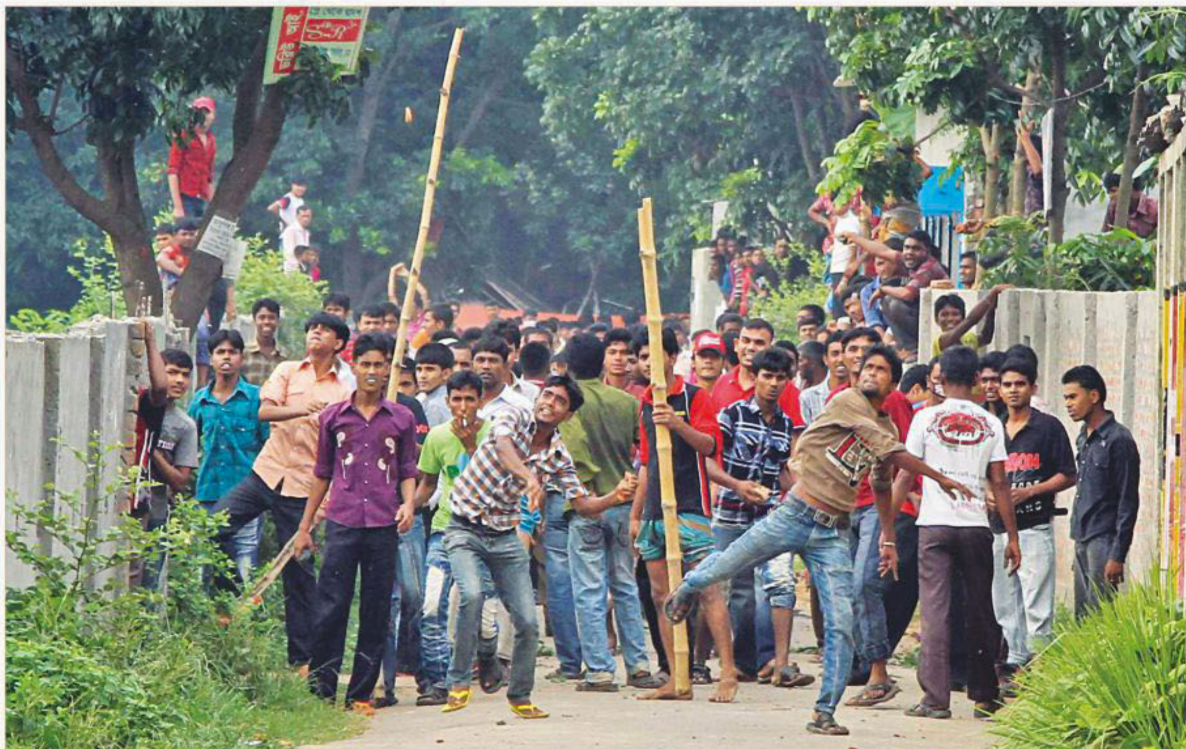
Agitators hurl brick chips at law enforcers at Jamgara, Ashulia, on the city outskirts yesterday.

EXPORTERS COUNT $10M LOSS A DAY -- PAGE 20