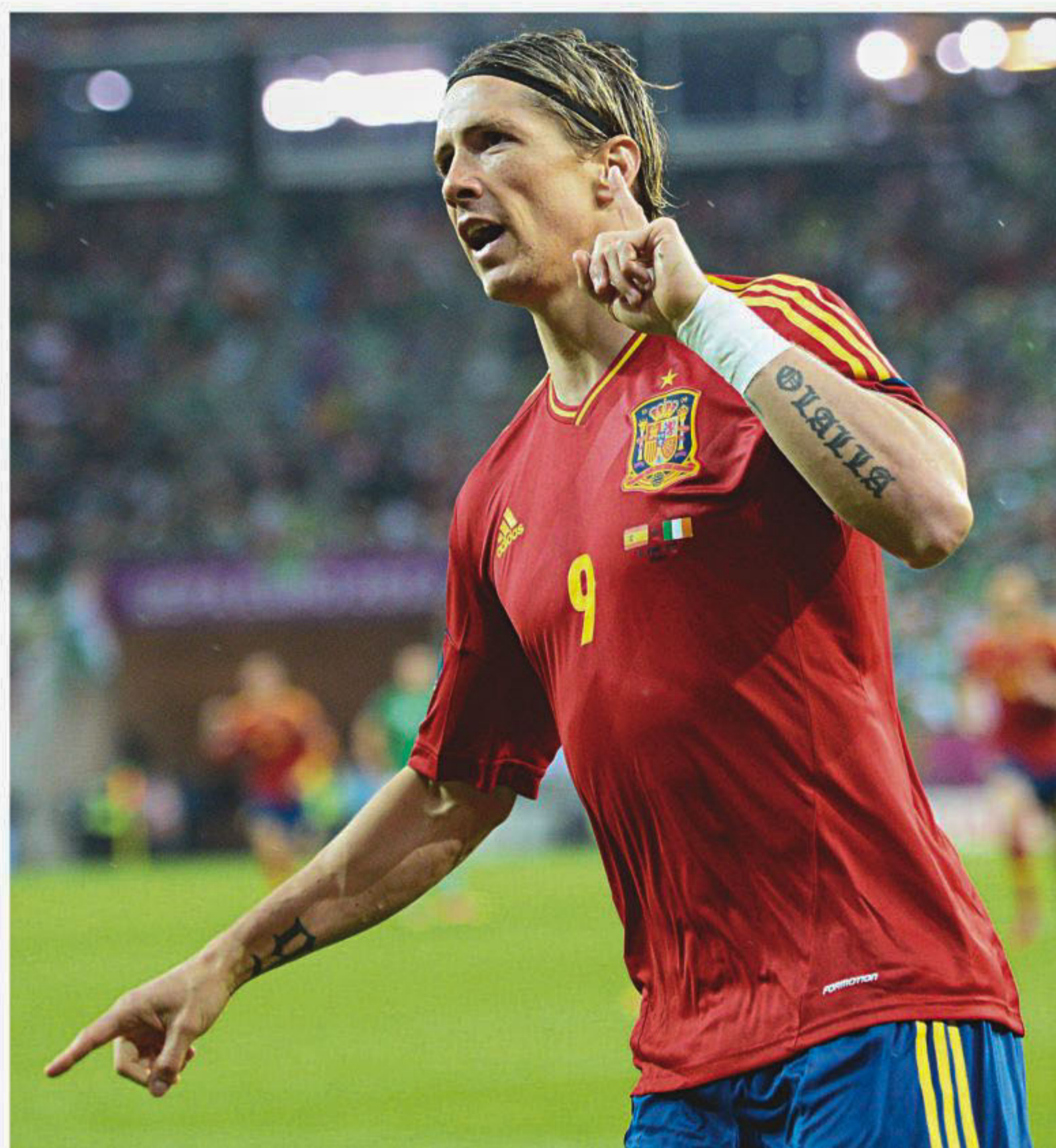
Spain striker Fernando Torres celebrates one of his two goals against Republic of Ireland during their Euro 2012 Group C match at the Gdansk Arena on Thursday.