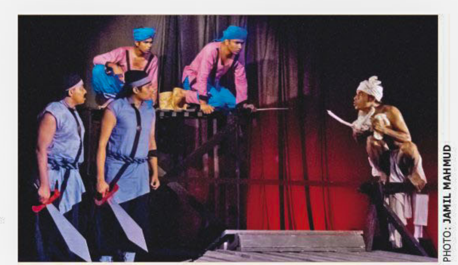
The troupe depicted a certain class of people, described in the Tagore text, by a pair of actors.