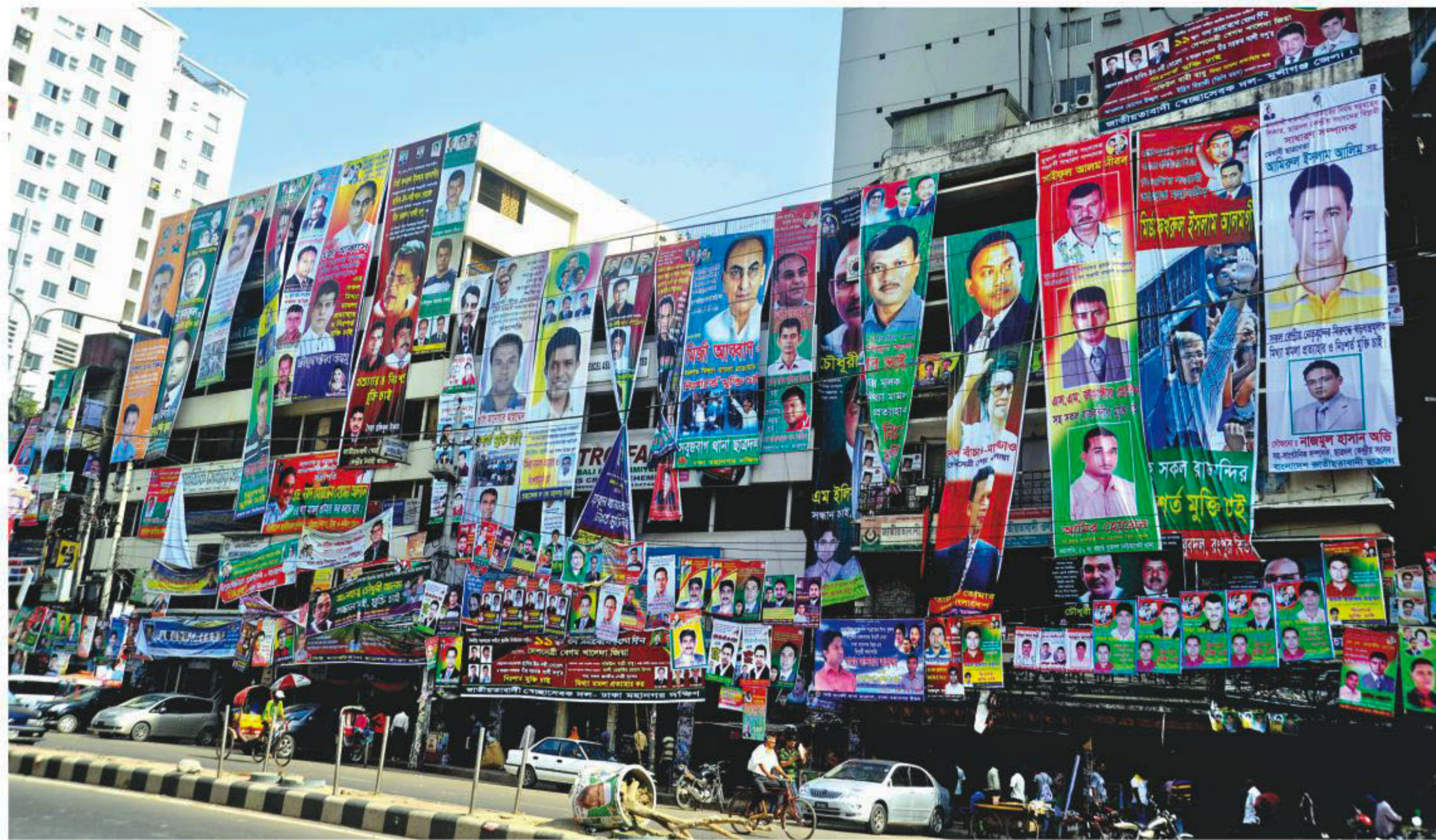
The capital's Nayapaltan, where the central office of the main opposition BNP is located, gets flooded with numerous posters and banners of the opposition pressing for the release of its detained leaders, among other demands. The posters and banners hide the view of the buildings that have no link with the opposition's issues. The photo was shot yesterday afternoon.