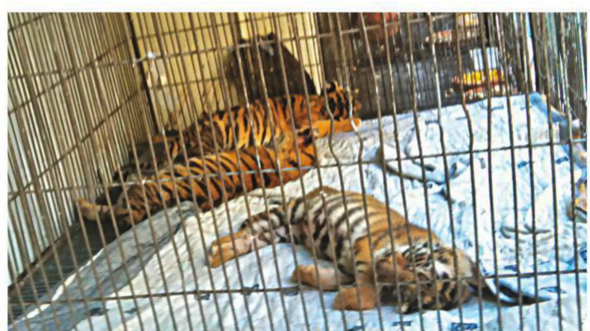
The tiger cubs recovered on Monday from the house of a wildlife trader are kept in a small bird cage at a private zoo in the capital yesterday.