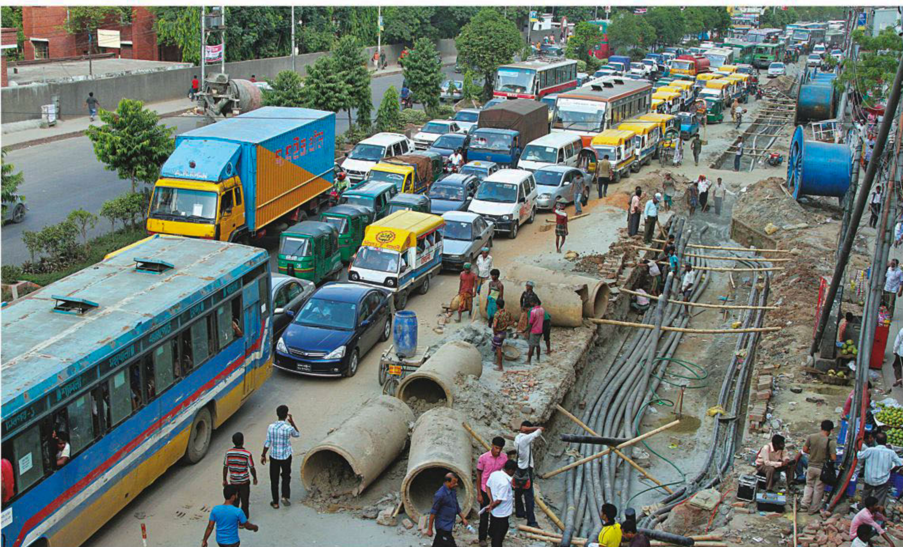
This road at the capital's Shyamoli remains heavily congested all day long as digging for installing utility lines has narrowed it down. The photo was shot yesterday.