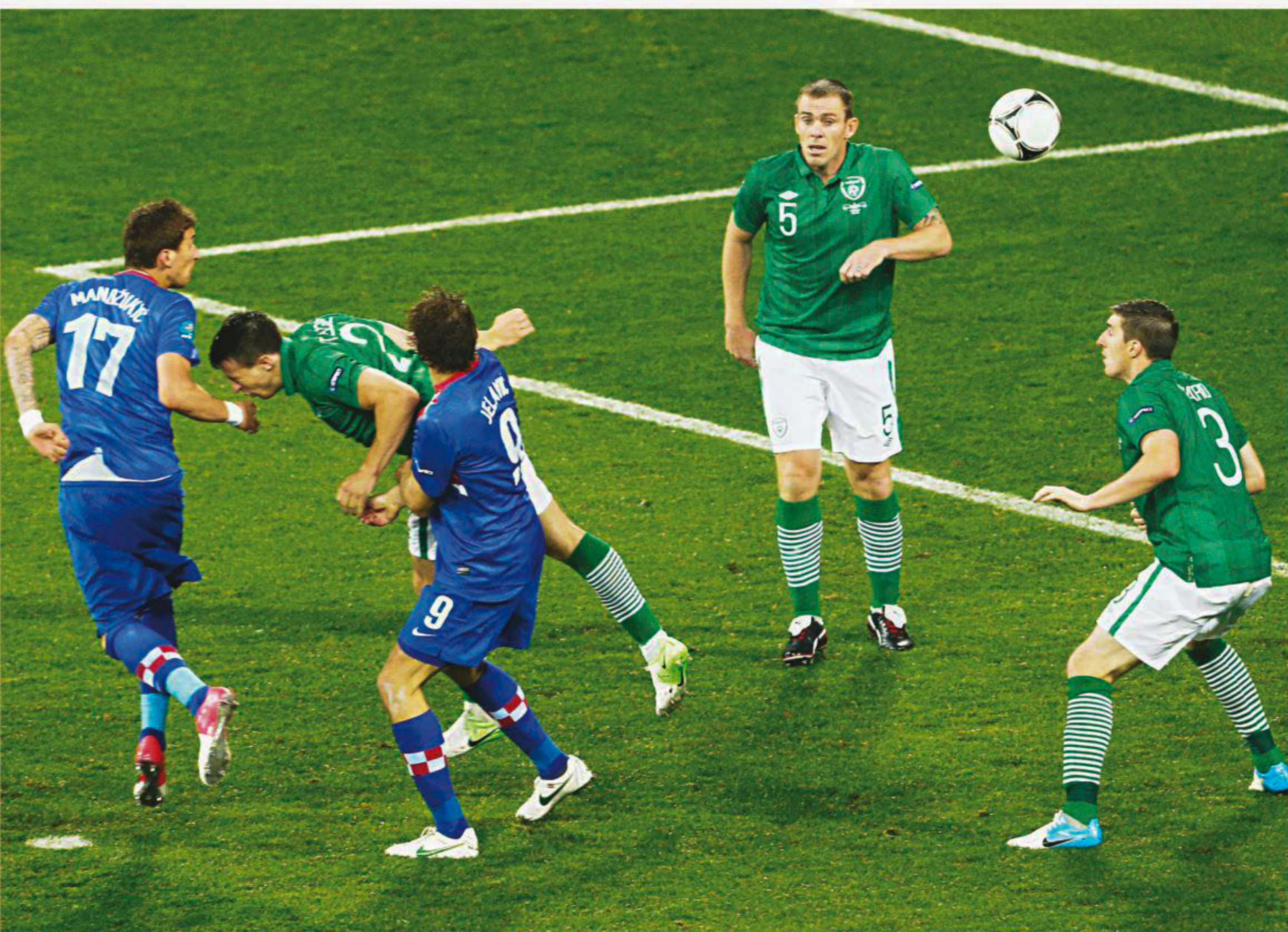
Croatia striker Mario Mandzukic (L) heads in the third goal against Ireland during their Euro 2012 Group C match at the City Stadium in Poznan on Sunday.