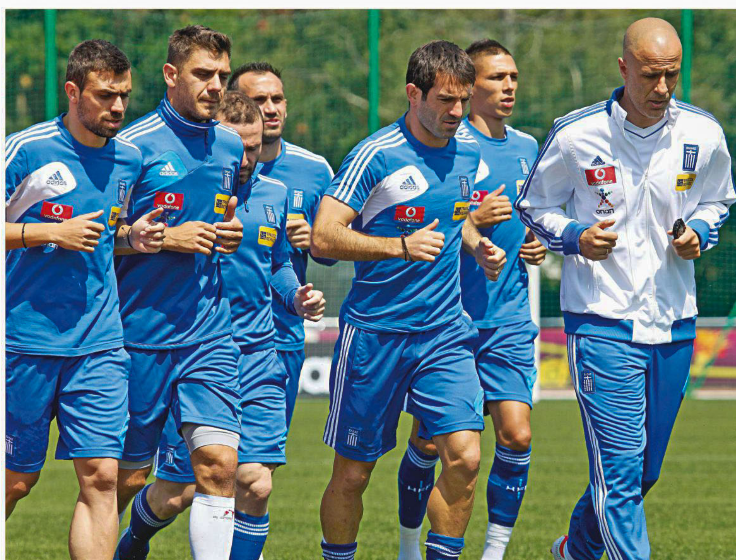
Greek players jog during a training session in Legionowo on Sunday. Greece will play the Czech Republic in Wroclaw tonight.

"When we saw there was no striker in the Spain team we joked about it. Initially I was a bit worried because a forward gives you someone to mark," he said.