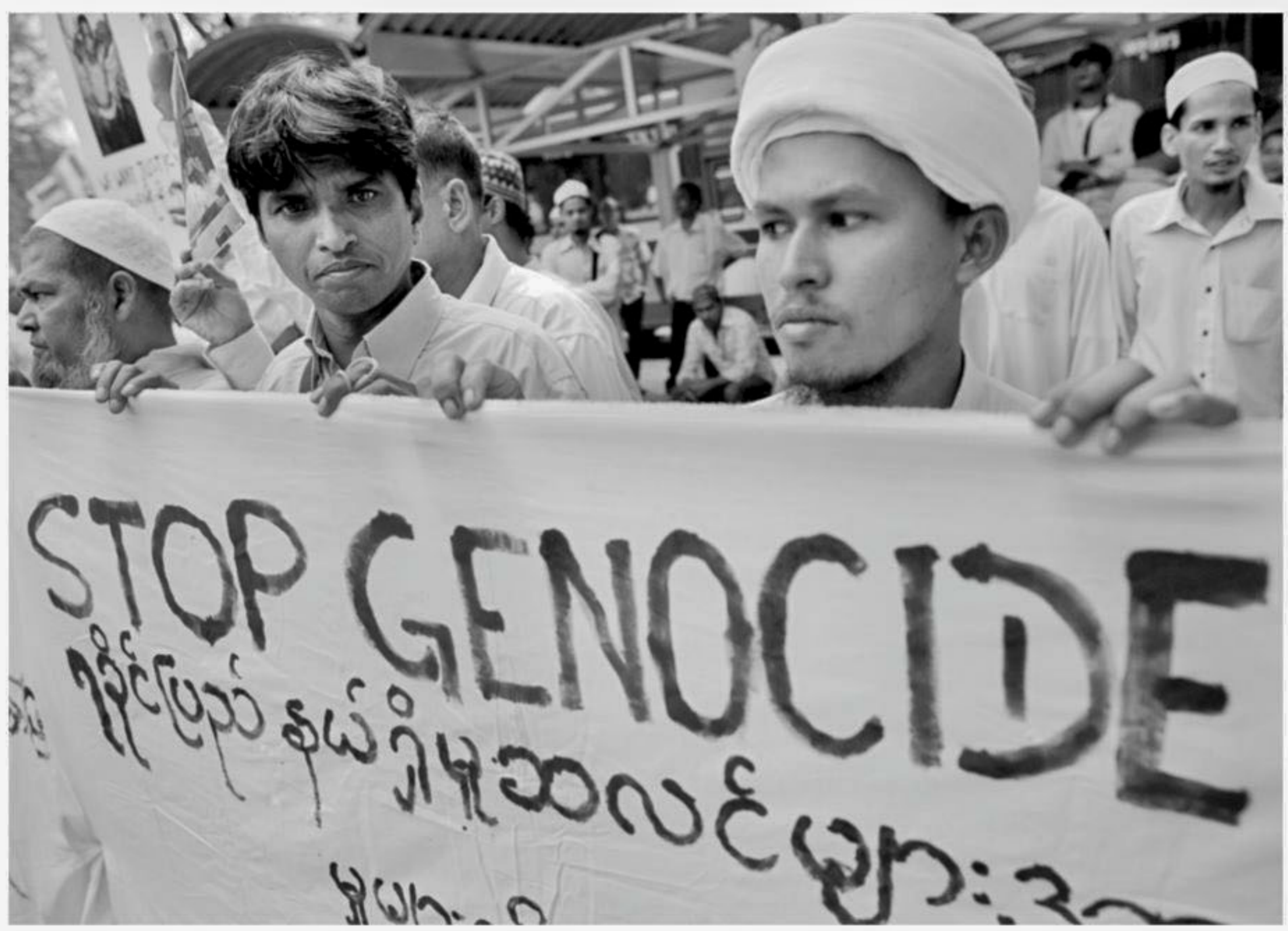
Rohingya protesters gather in front of a United Nations regional office building to call for an end to the ongoing unrest and violence in Myanmar's Rakhine State in Bangkok yesterday.