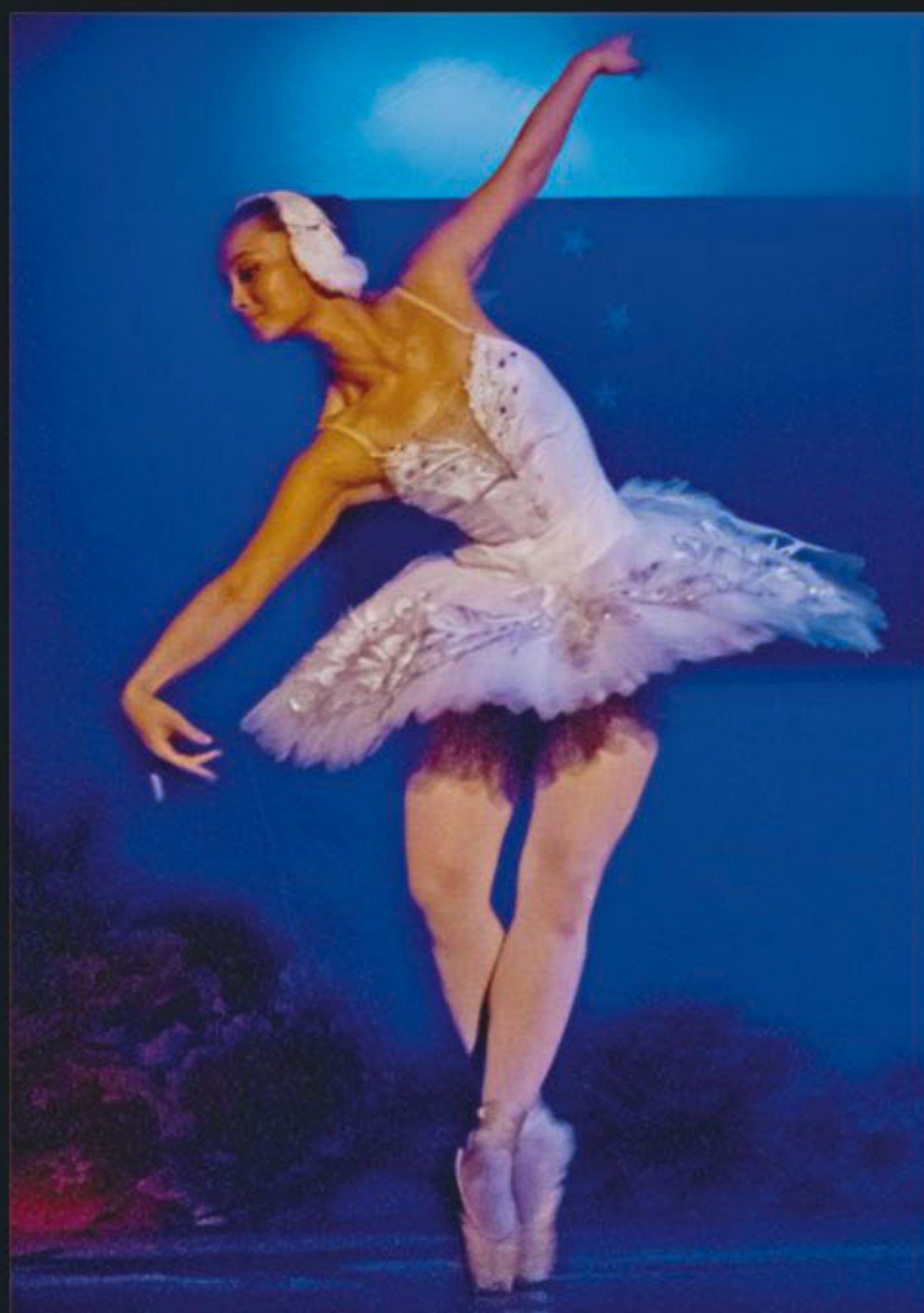
The vibrant colour that the Dhaka audience expects from a Chinese troupe was present in ample measure.

As the musicians performed traditional Chinese instrumentals and songs, they also borrowed popular