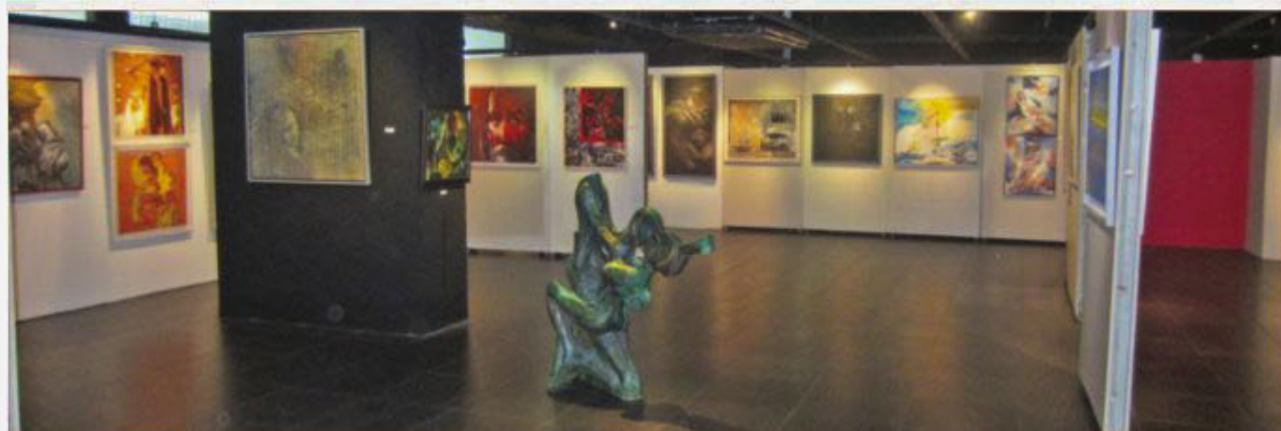
Artworks on display.

The exhibition will continue till July 9.