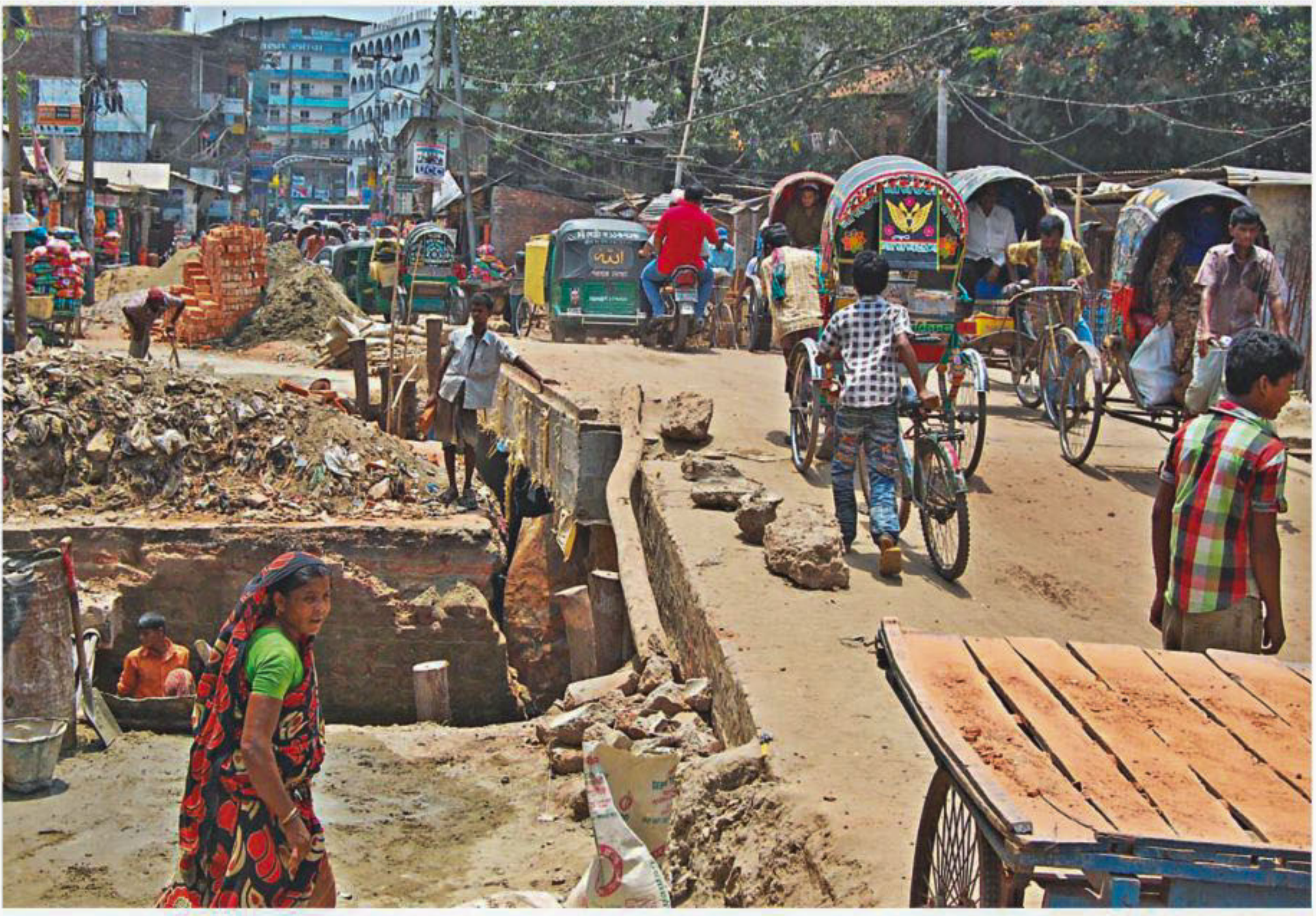
The residents of Amanat Khan Road in Pathantuli area of Chittagong city have been suffering for long due to the slow pace in the expansion work of the road and construction of a culvert. The road expansion is being carried out by Chittagong Development Authority and Chittagong City Corporation is constructing the culvert. The photo was taken recently.