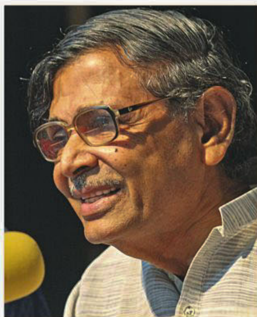
Prof Abdullah Abu Sayeed