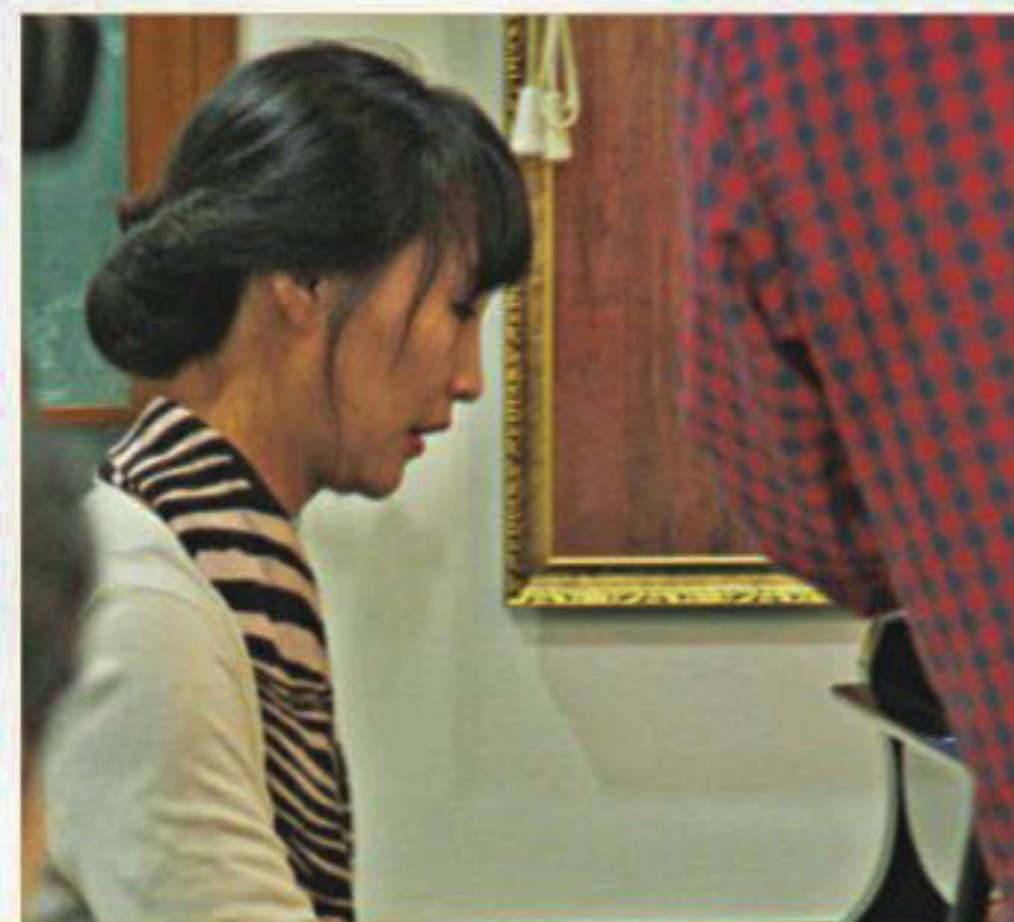
Artistes perform at the programme.