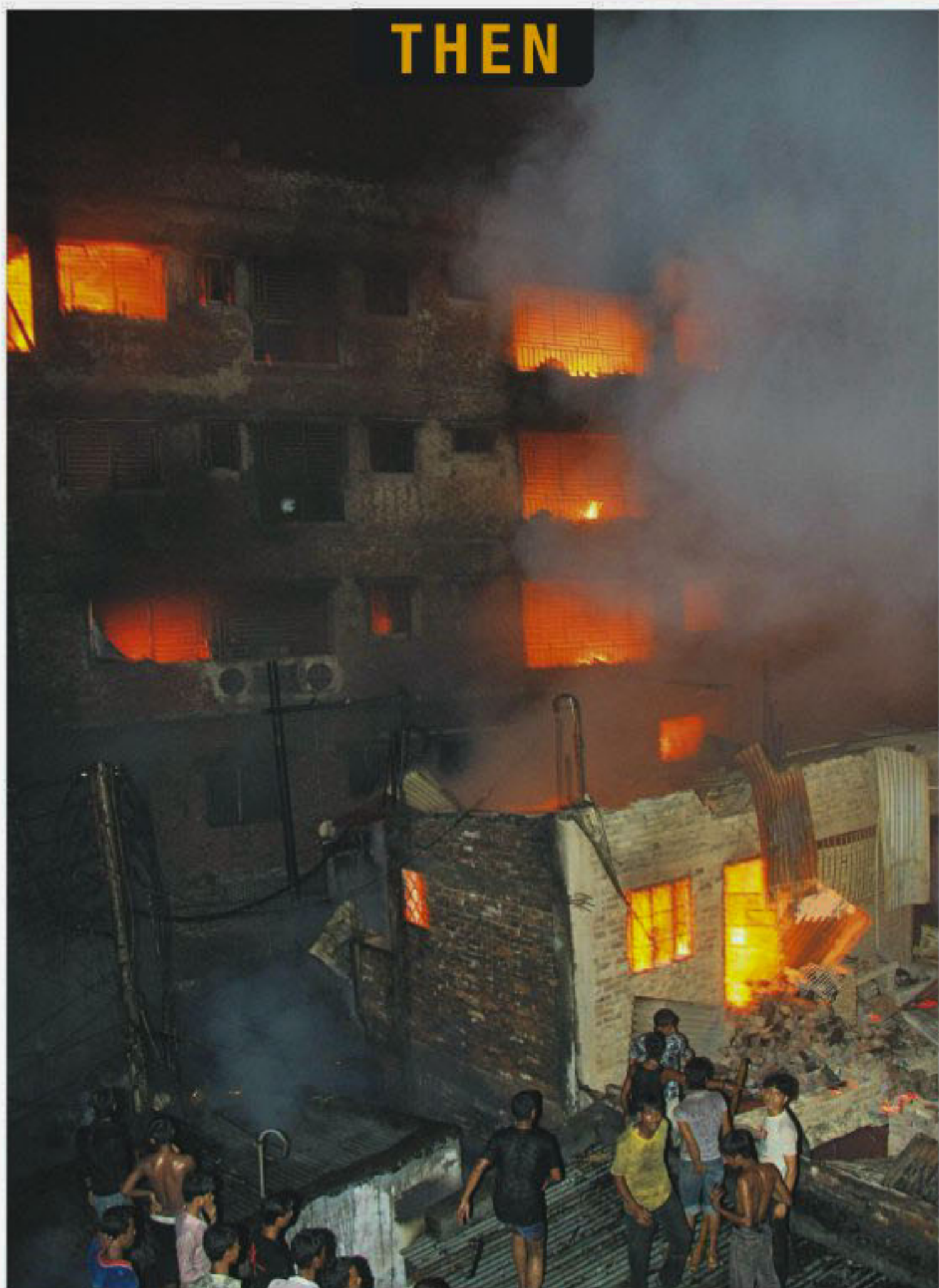
The building burned in the 2010 Nimtoli blaze comes back to life after being renovated and filled by people. The fire, one of the worst disasters in the capital, killed at least 44 residents of the building alone and many others in the old town neighbourhood.

Fire fighters had said the blaze originated from a stove in the building that housed a combustible chemical warehouse on its ground floor. Coming in contact with the chemicals, the fire got deadlier, engulfing eight residential buildings and some 20 shops within a few minutes.