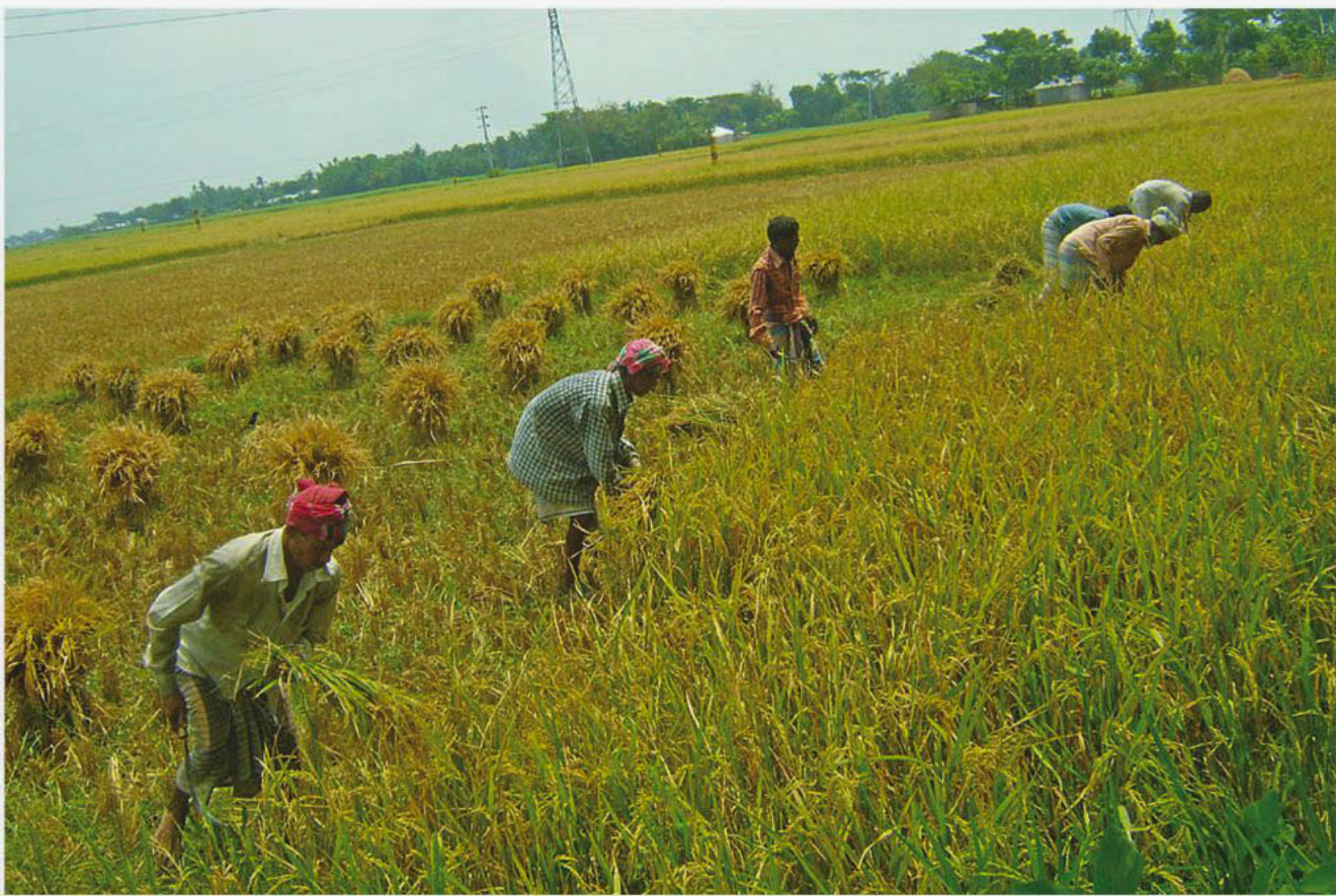
A recent photo shows workers busy harvesting Boro paddy in Maligasa village of Pabna.