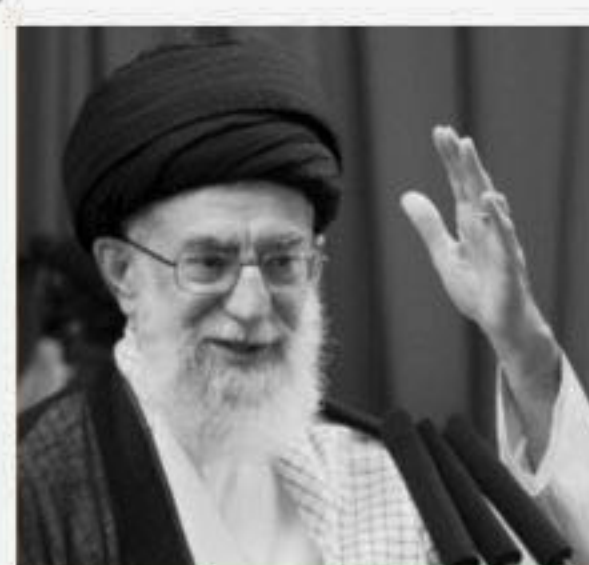
Ayatollah Ali Khamenei

Khamenei also said international circles and media are lying about Iran's nuclear ambitions. He said the propaganda is launched to divert public opinion from US and Europe's financial woes.