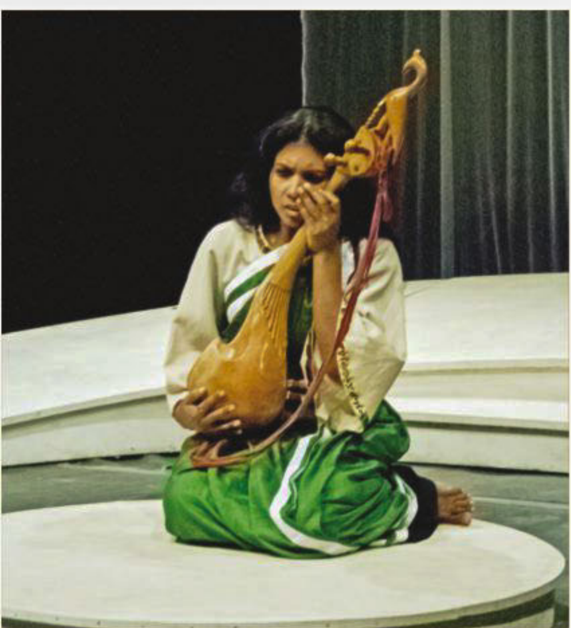
A scene from "Domer Madar".

Today, Fujairah Cultural and Media Authority, UAE will present "The Pianist" at the National Theatre Hall. Department of Theatre, DU will stage folk ballad "Bhelua" at the Experimental Theatre Hall, while Shabdo Natyacharcha Kendra will stage "Rifle" at the Studio Theatre Hall.