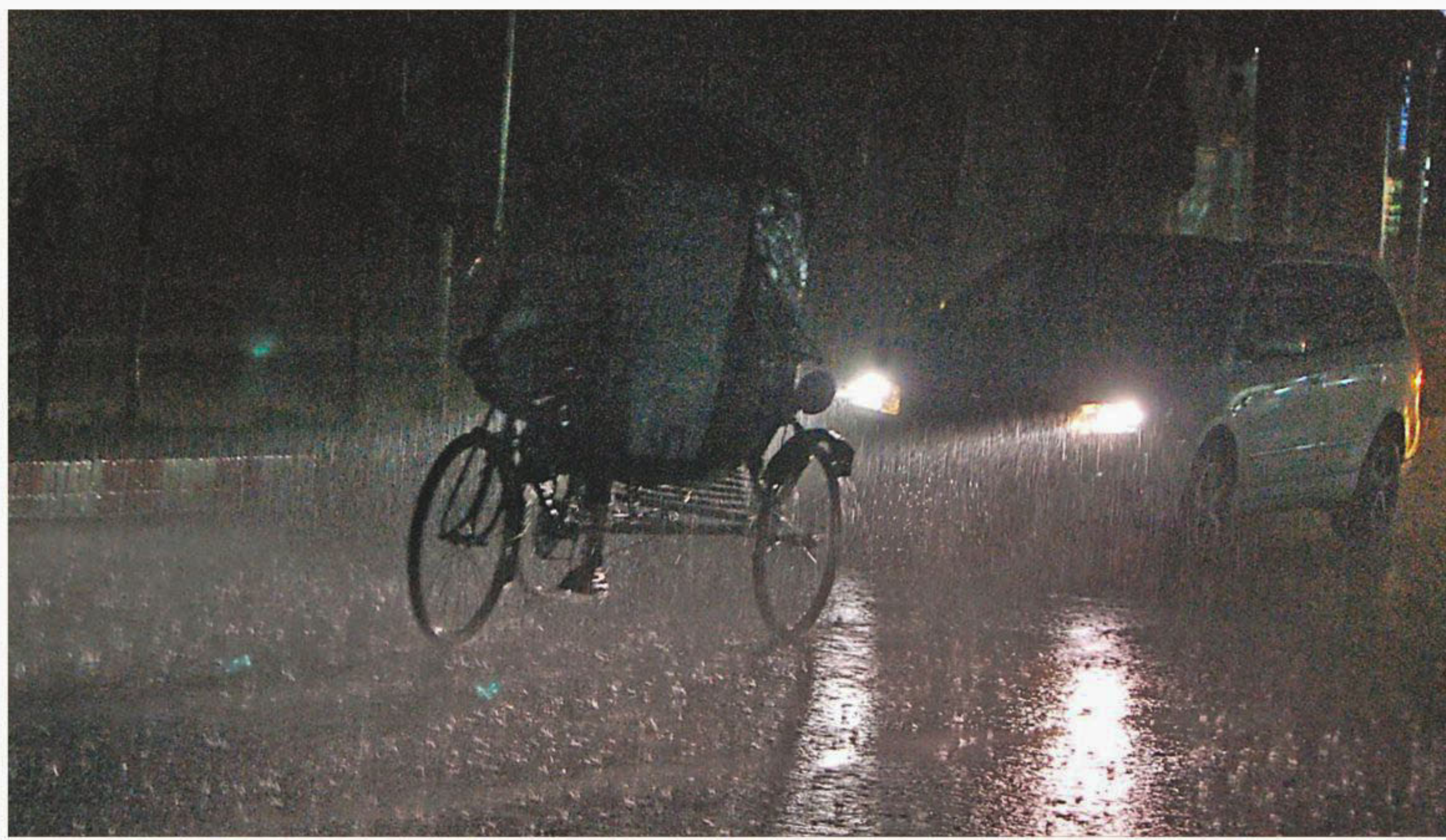
The people of Chittagong city breathe a sigh of relief as rain started falling on Thursday night following a fortnight of pre-monsoon heat wave. The photo was taken in the city's Jamal Khan area.