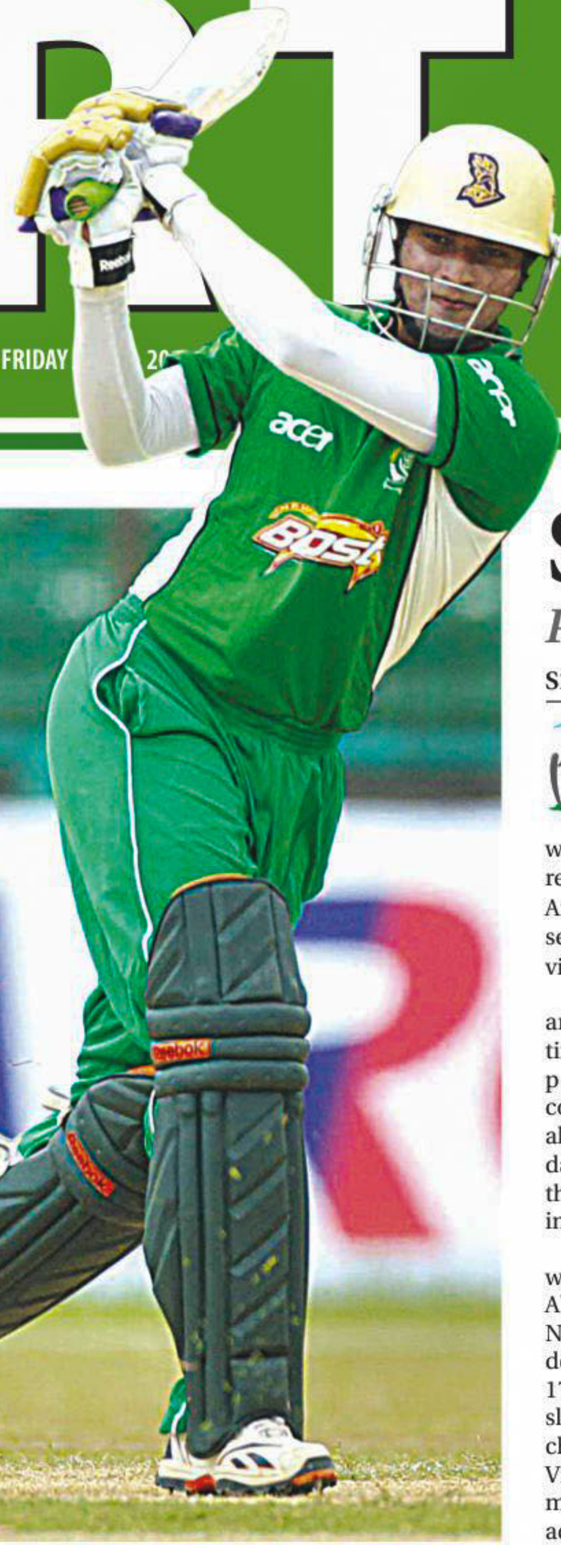
Victoria's star all-rounder Shakib Al Hasan plays the pull shot during his side's 5-wicket victory over Abahani in the Dhaka Premier Division Cricket Super League match at the Fatullah Cricket Stadium yesterday.