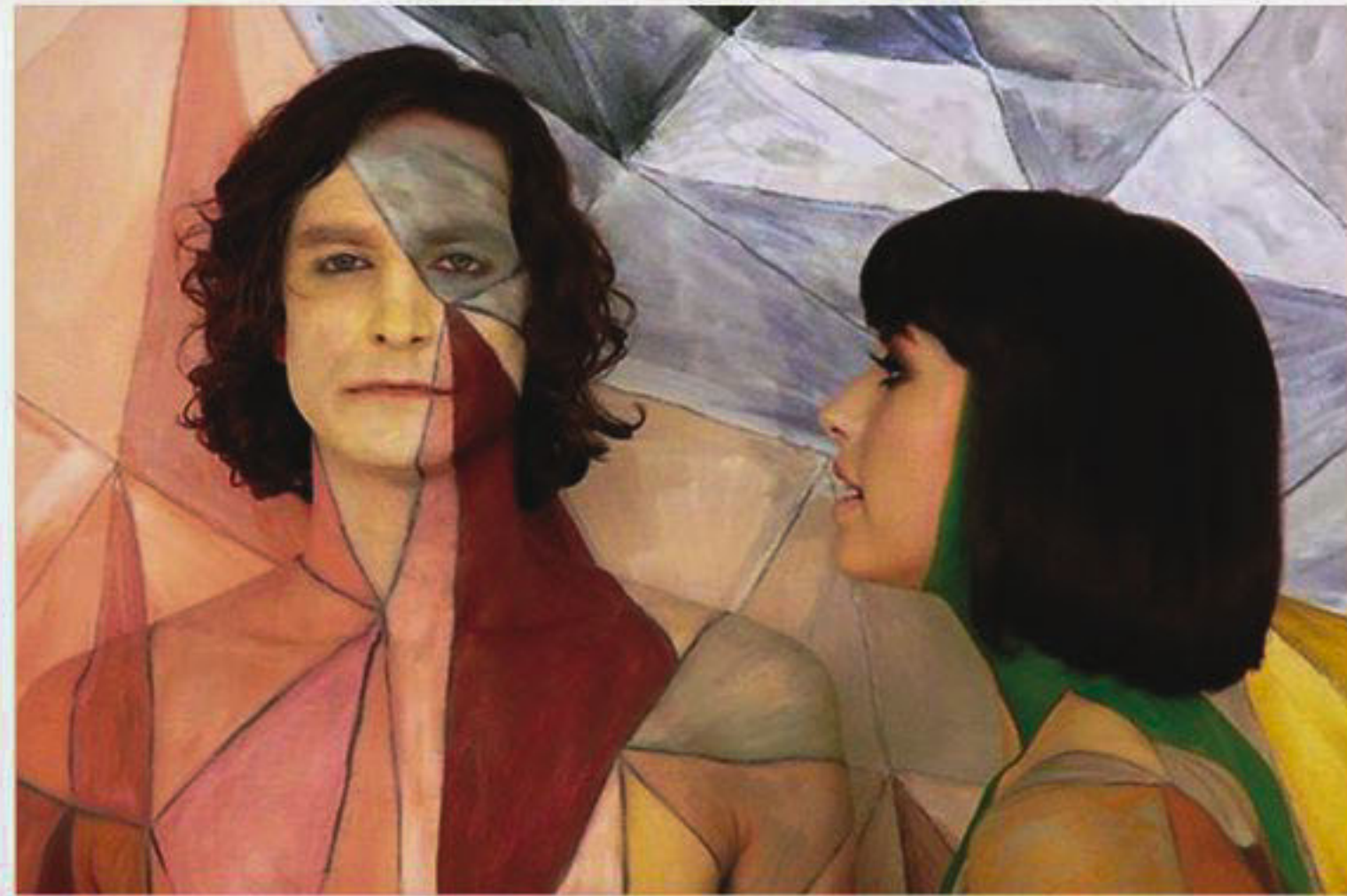
Kimbra (right) with Gotye.

"Vows," which was released in Australia in September 2011 and hit U.S. stores and online last week, spans five years of Kimbra's life from age 17 to 22. She describes it