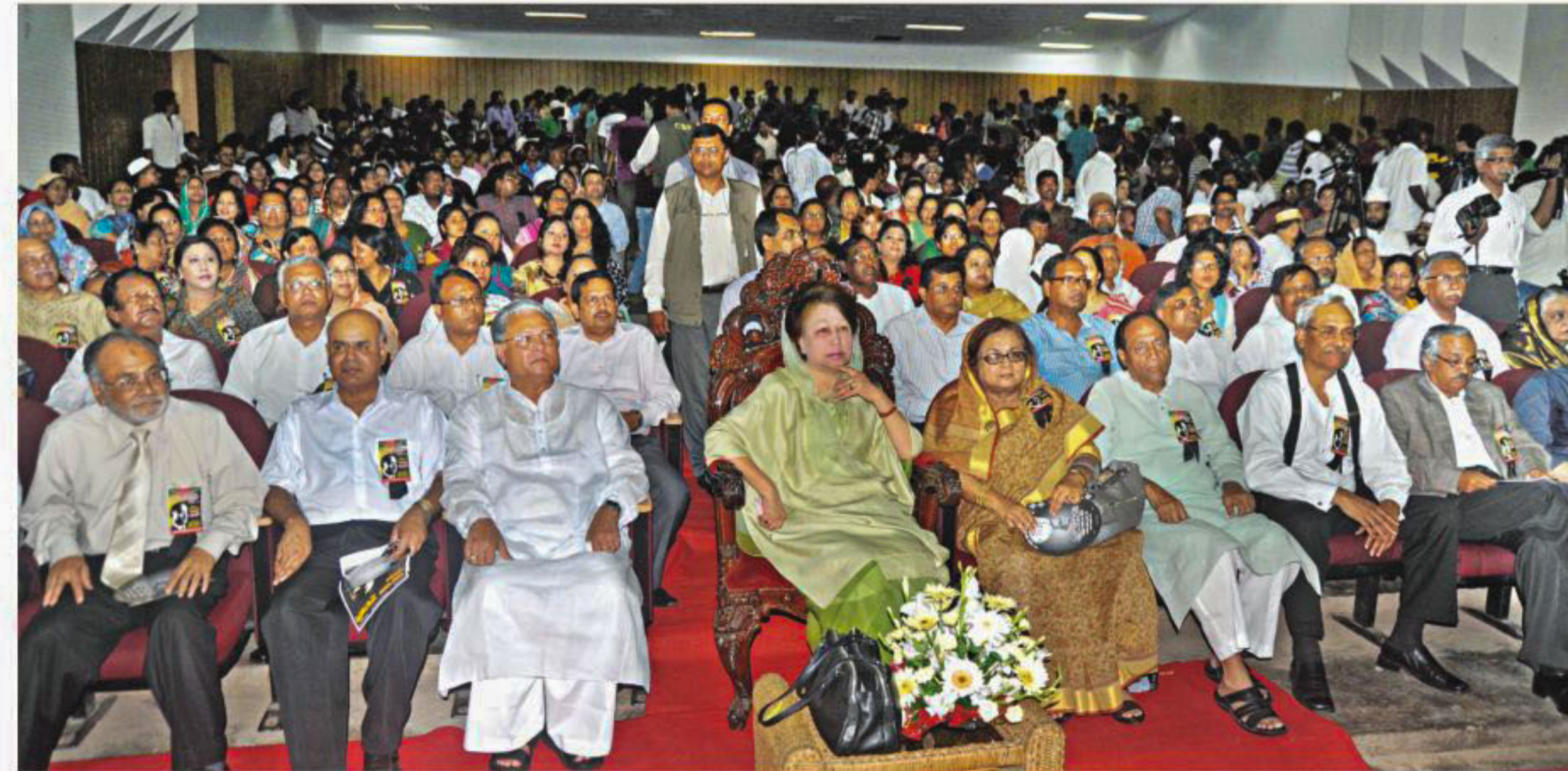
Leader of the Opposition in Parliament and BNP Chairperson Khaleda Zia sits with the audience while attending as chief guest a party discussion at the Institution of Engineers, Bangladesh auditorium in the capital yesterday on the occasion of 31st death anniversary of the party's founder late president Ziaur Rahman.

The petition prayed to the court to direct the authorities to cancel its decision to fill up the pond to protect the environment.