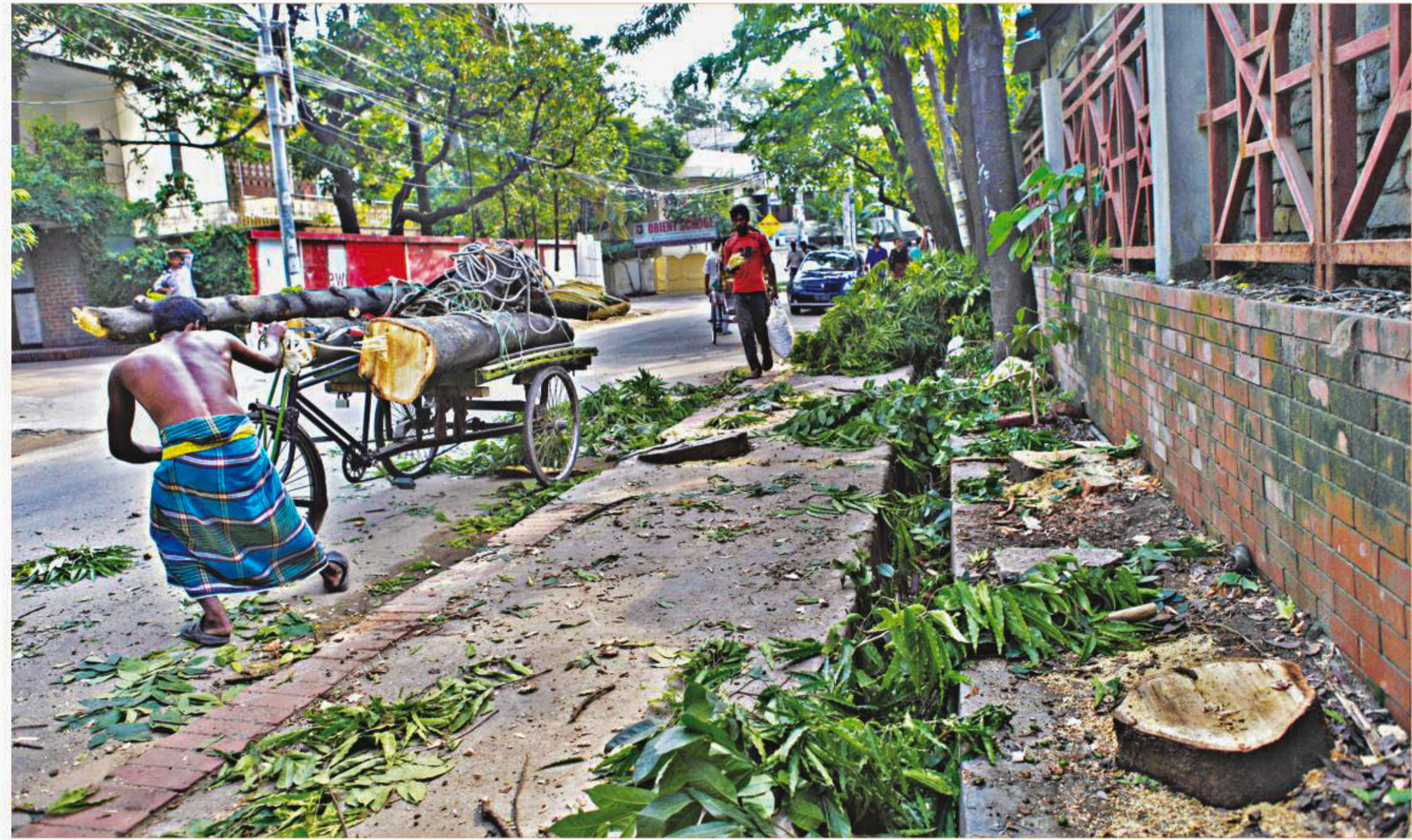
Six trees were cut off on Road 8 beside the Dhanmondi Club playground in the capital. The club authorities carried out the act in the name of widening the club's entrance gate. The photo was taken yesterday.