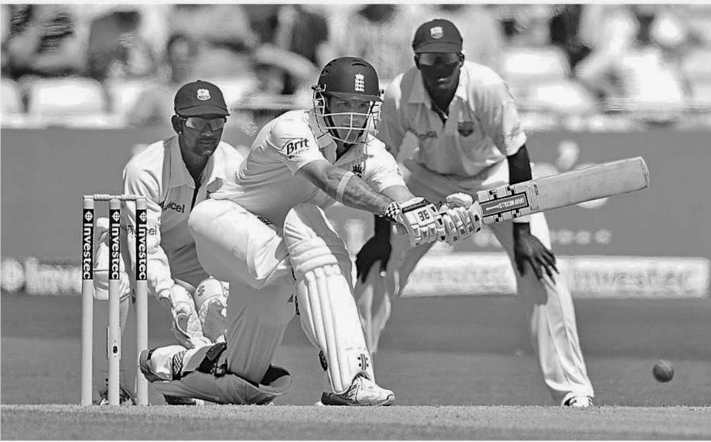
Andrew Strauss sweeps one on his way to 141 against West Indies on the third day of the second Test at Trent Bridge in Nottingham yesterday.