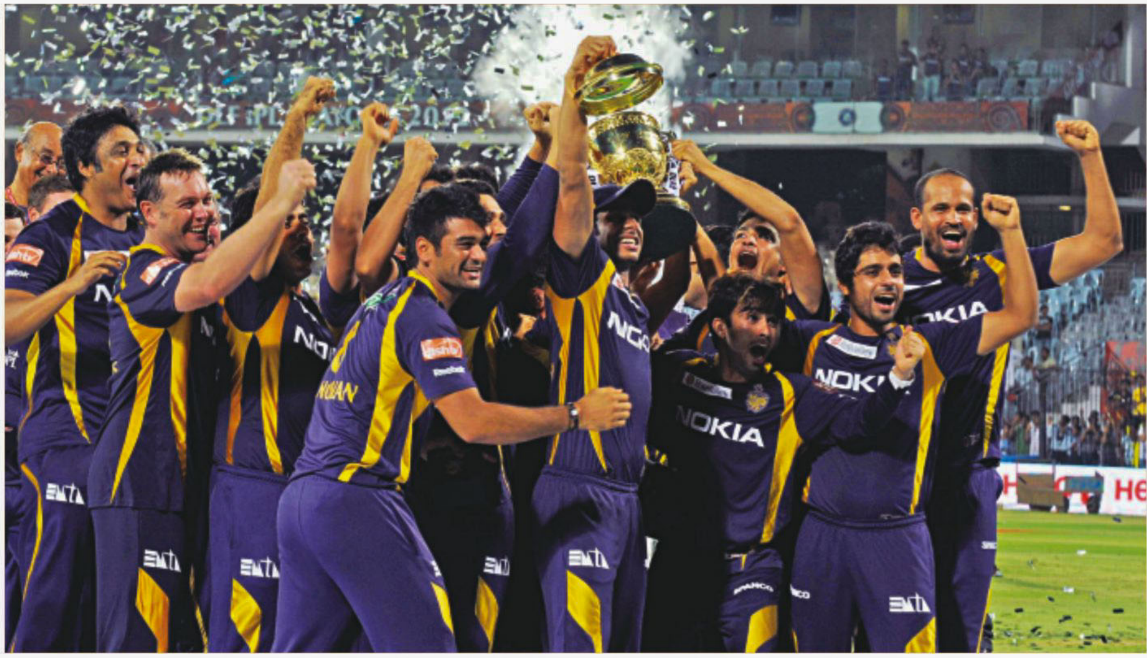
Kolkata Knight Riders players celebrate with their maiden IPL trophy after defeating Chennai Super Kings in the final at the MA Chidambaram Stadium yesterday.