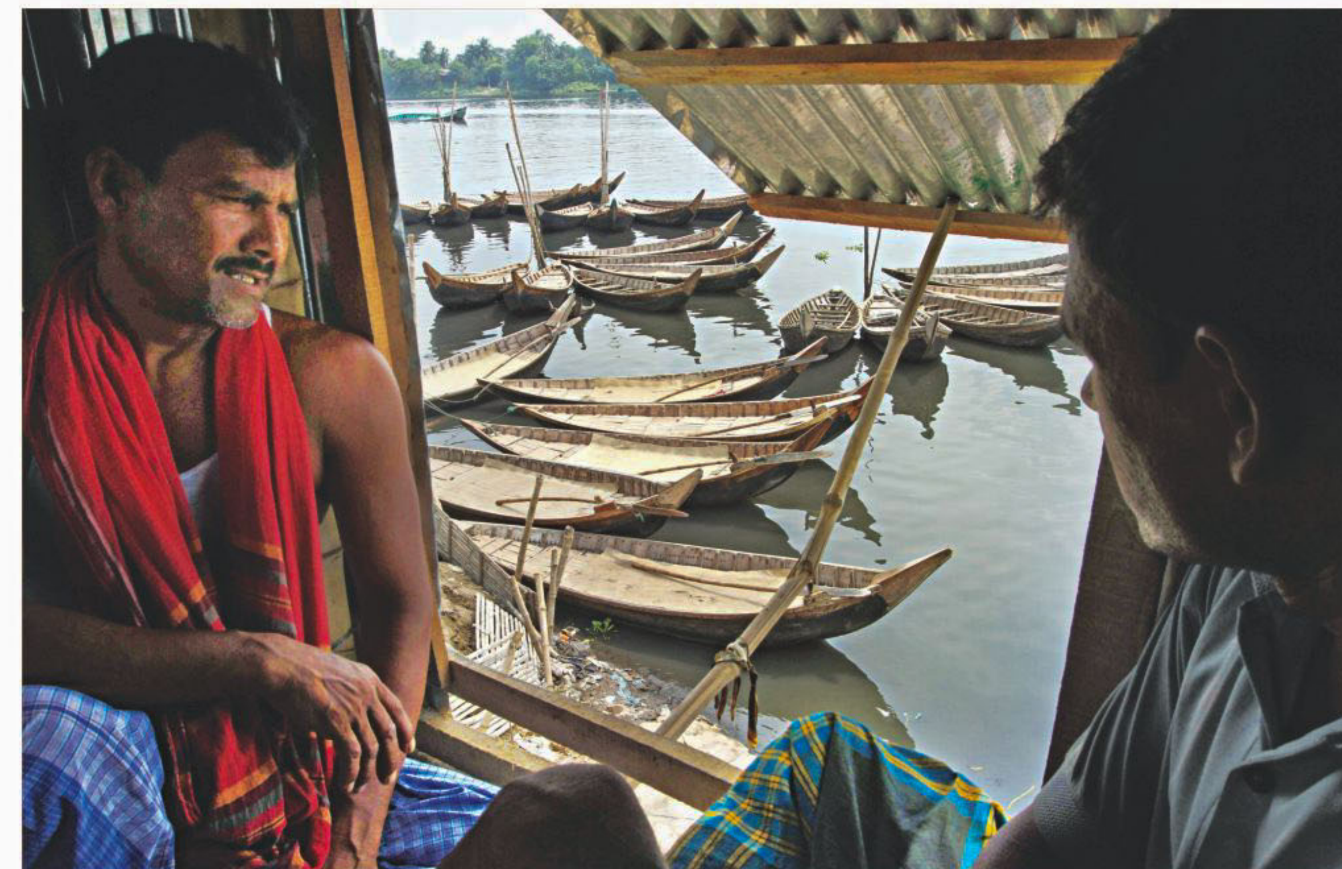
With the scorching midday heat beating down on them, boatmen at Kholamora Ghat at Kamrangirchar in the capital anchor their vessels and seek refuge under an adjoining makeshift tin-structure yesterday.

Koica will also instruct the participants in the dissemination of agricultural technology, marketing