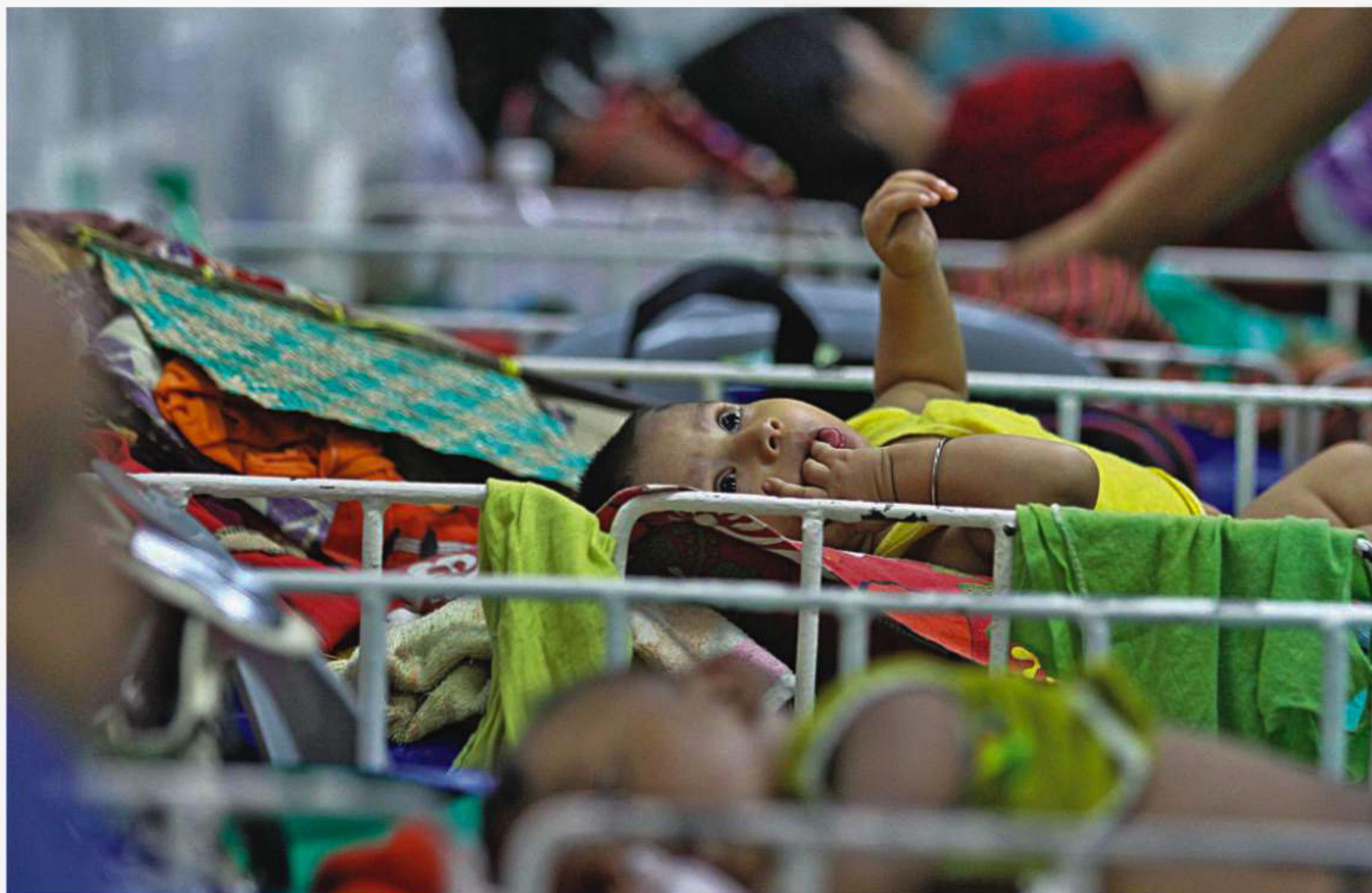
An infant suffering from diarrhoea lies in the bed of ICCDR, B in Dhaka yesterday. The city sees a soaring number of diarrhoea cases amid the summer heat over the last couple of weeks.