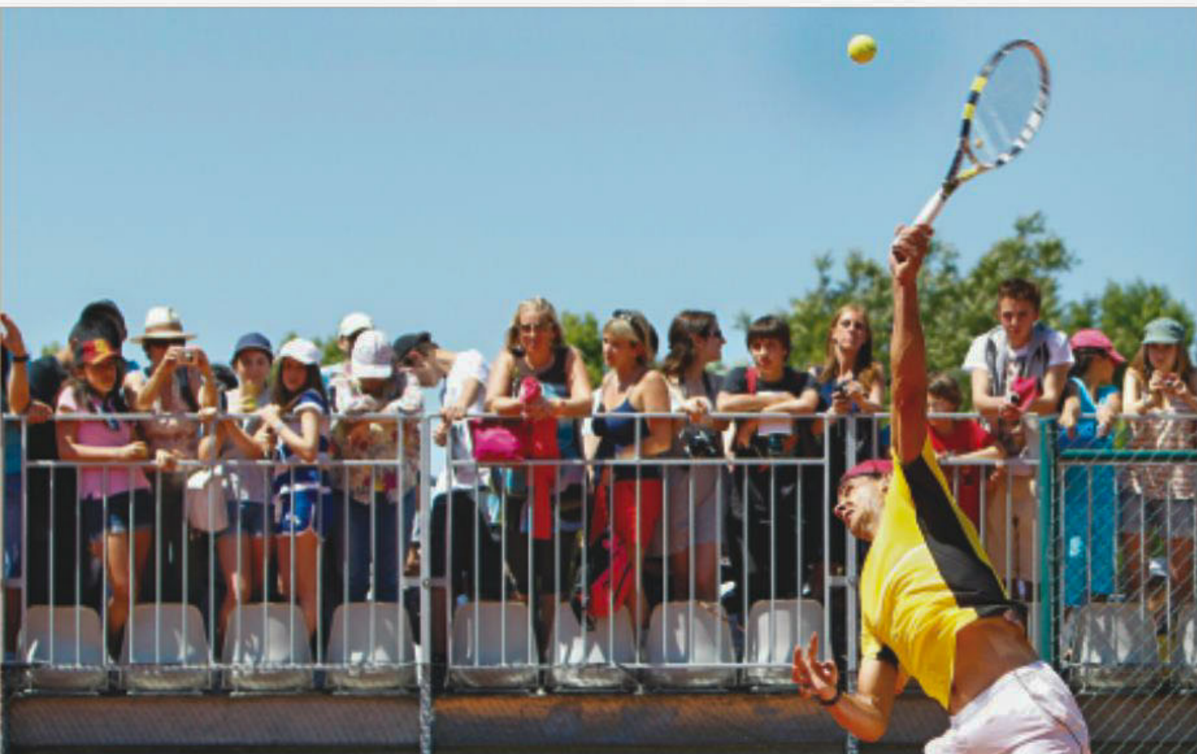
Fans watch clay king Rafael Nadal training at the Roland Garros in Paris on Saturday, a day before the start of the French Open that the Spaniard has won six times.