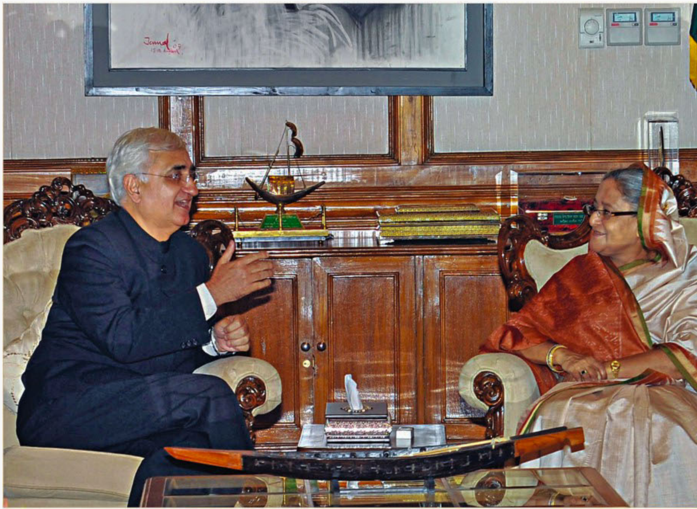
Indian Minister for Law, Justice and Minority Affairs Salman Khurshid calls on Prime Minister Sheikh Hasina at her official Gono Bhaban residence in the capital yesterday.