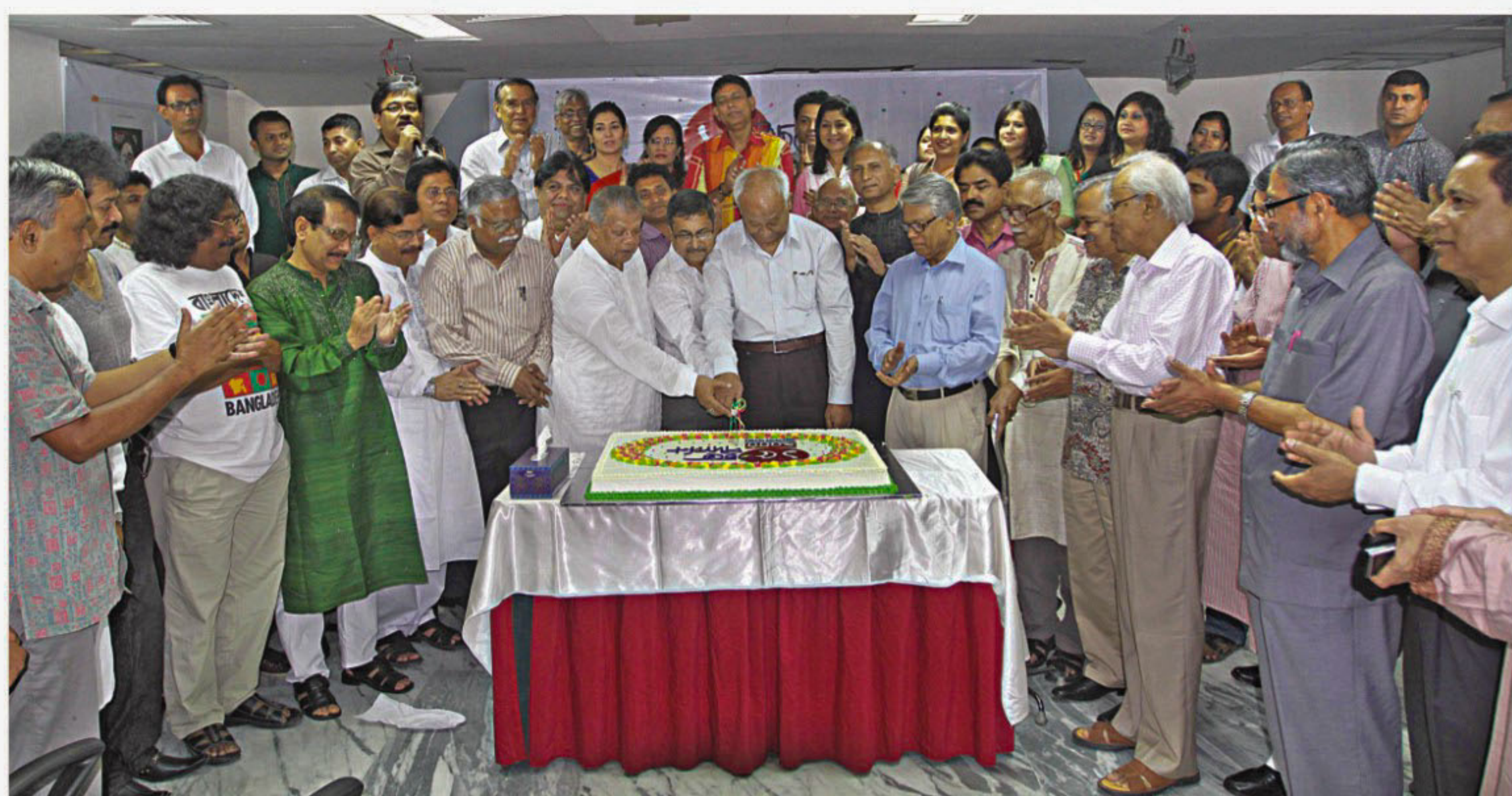
Deputy Speaker Shawkat Ali cuts a cake on the occasion of the 14th anniversary of Shaptahik 2000, a weekly magazine, and Anandadhara, a fortnightly entertainment magazine, at The Daily Star Centre in the capital yesterday.

"Although the pin was open, the grenade did not explode. Perhaps, there was a technical fault," he said, adding that they were trying to identify the country where it was made.