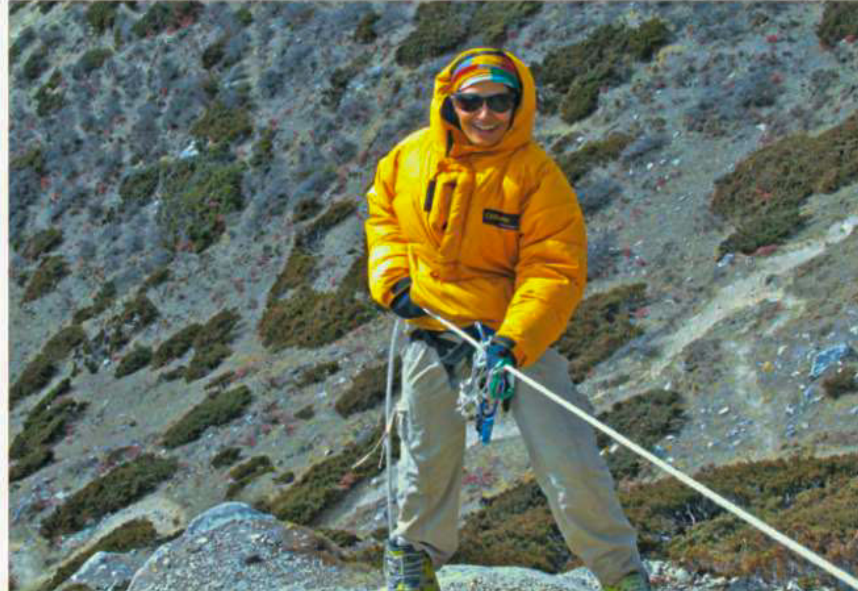
Wasfia Nazreen during a mountaineering expedition. Another photo on page 19.