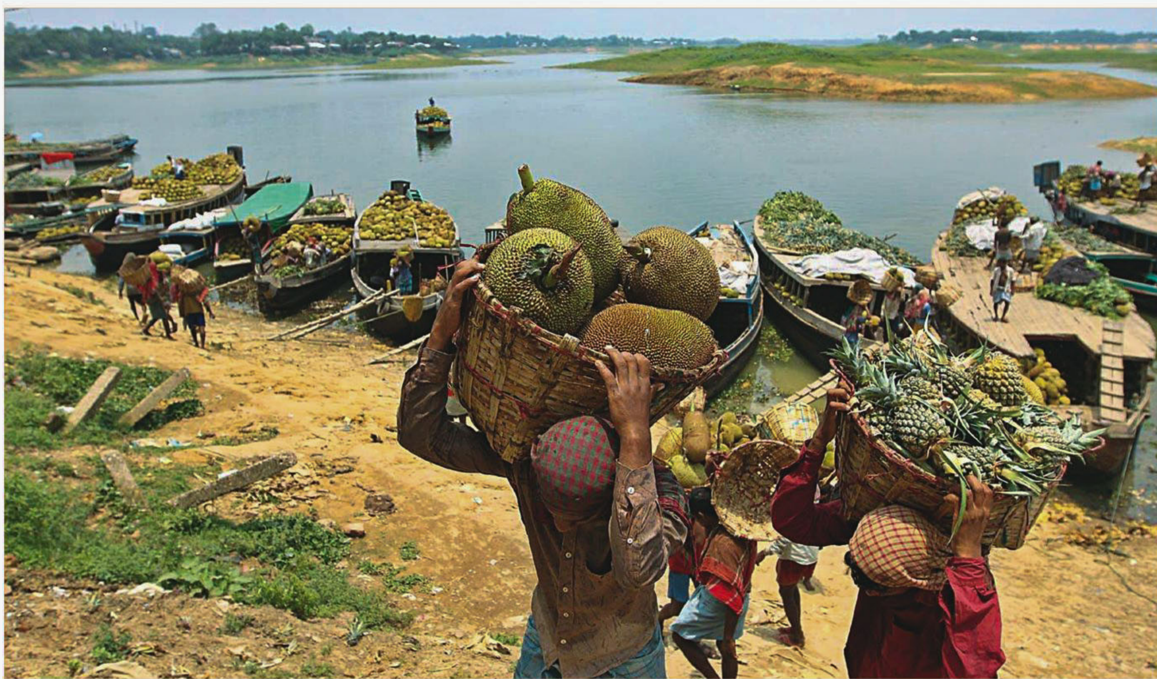
Farmers in Chittagong hill areas have had good yields of summer fruits this year. They sell the fruits to wholesalers through whom the produce reaches the markets countrywide. The traders buy a jackfruit only at Tk 15-25 and a pineapple at TK 5-10 but sell those at much higher prices. The photo was shot at Rangamati a few days ago.