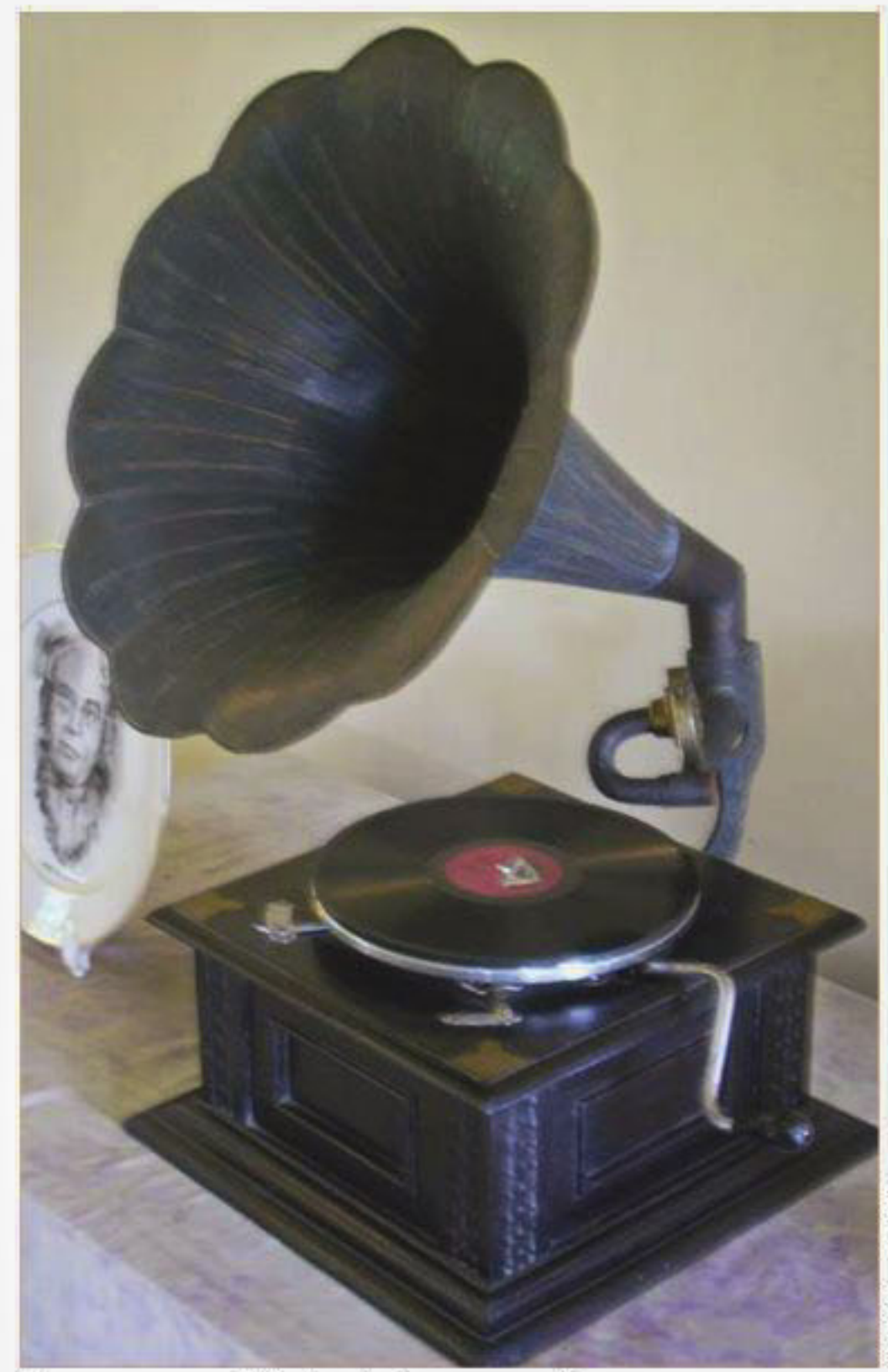
The memorabilia include gramophones.

The memorabilia kept at the two centres include gramophones and records released by His Masters Voice Company; handwriting of the poet in Bengali, English, Hindi and Urdu; a bed used by Nazrul during his stay at Kazir Shimla and some rare black and white photographs of the poet and his family members.