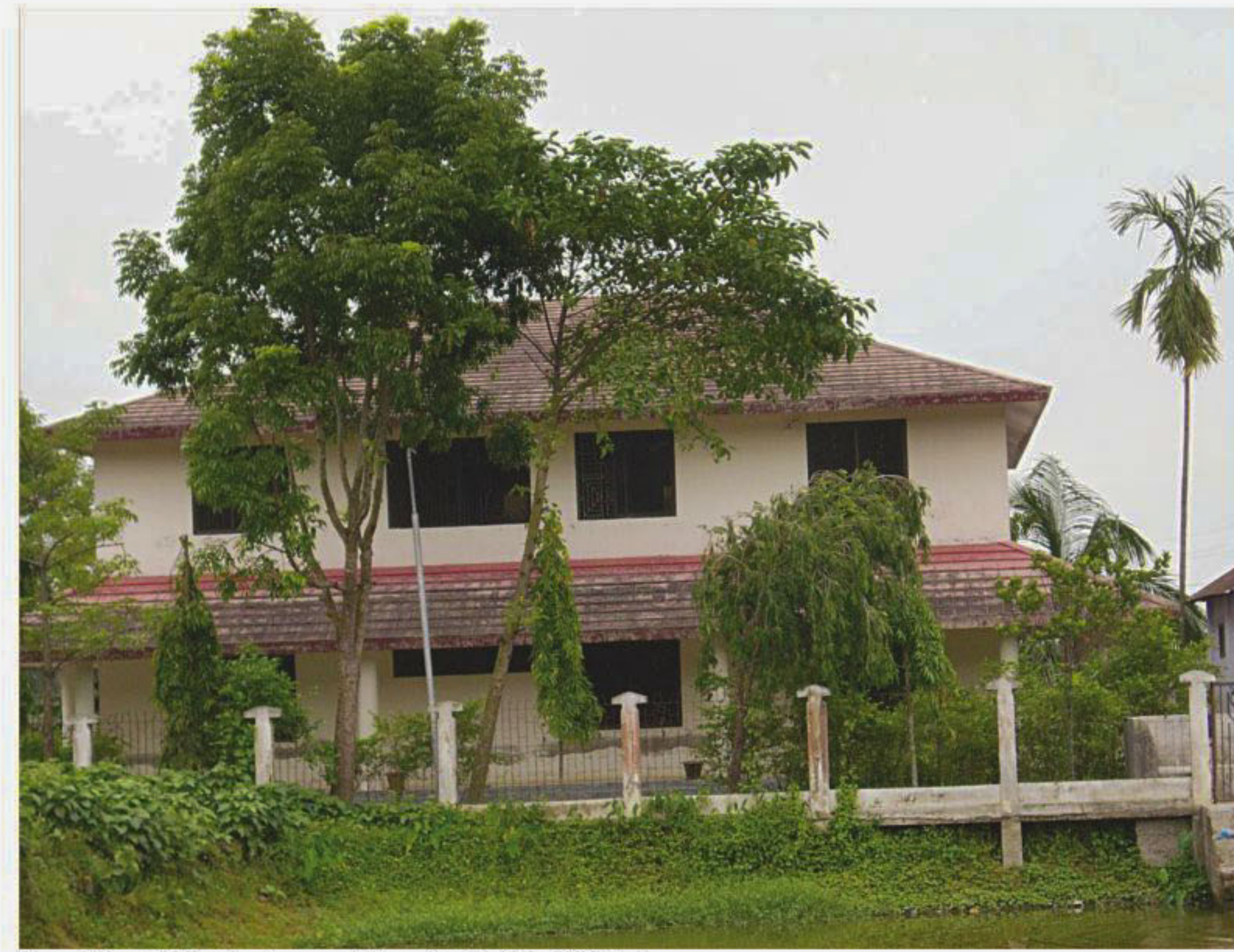
Nazrul Smriti Kendra (memorial centres) at Kazir Shimla.