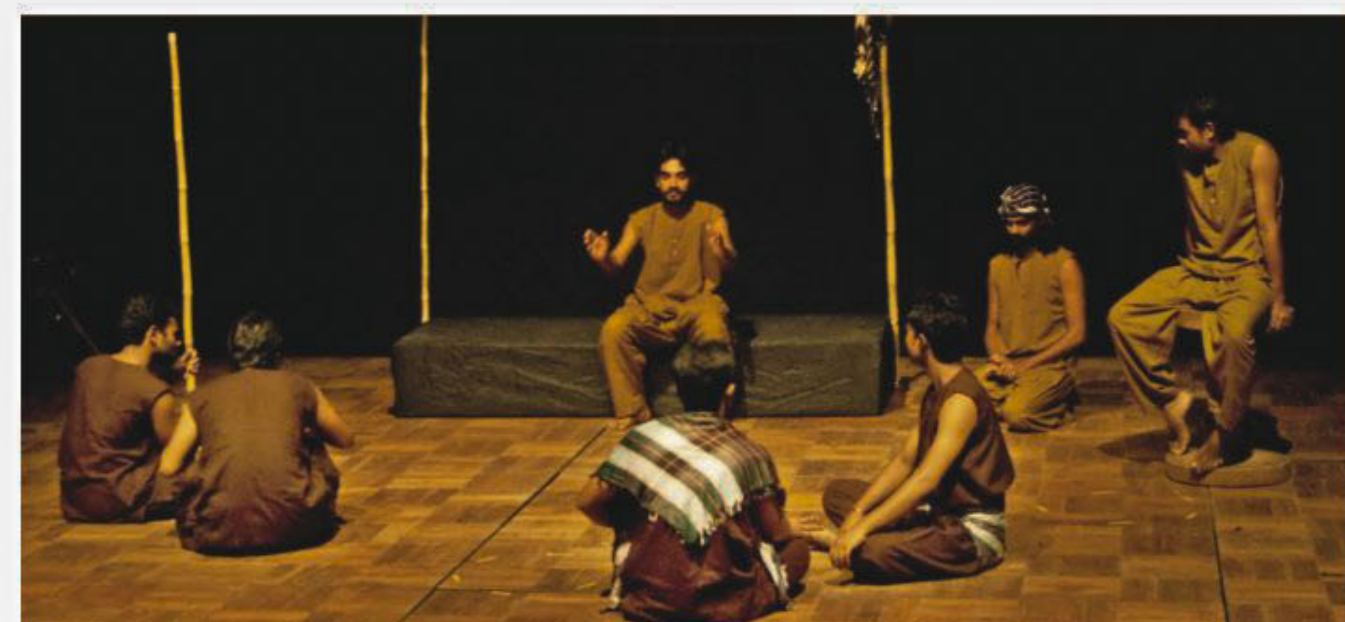
The play highlights the consequences of terrorism, in the name of religion, in an imaginary society.

The story follows an individual, who used to be a bright student and believed in communism, but in the course of time has turned a terrorist. One day, he meets an old friend who is a journalist. The radical change of her friend perturbs the journalist. The jour-