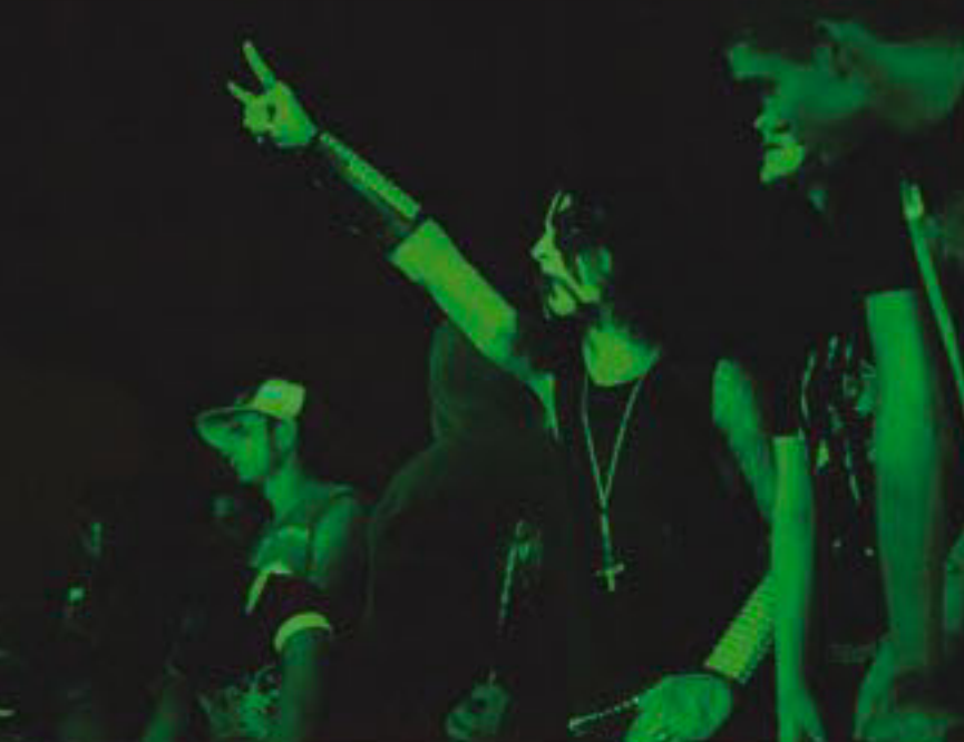
Fans at 666 Fest in March 2012.