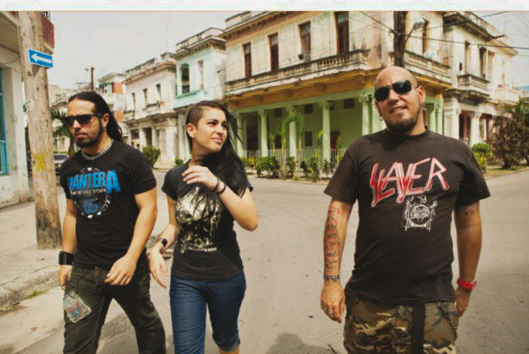
Cuban band Escape strolls through Old Havana.

The 666 Fest isn't Cuba's biggest metal festival -- the show drew approximately 200 people. In a country ruled for more than 50 years by Communist regime, heavy metal has taken hold over the past two decades in a major way. While its audience is dwarfed by that for salsa or reggaeton, its stylistic lean-