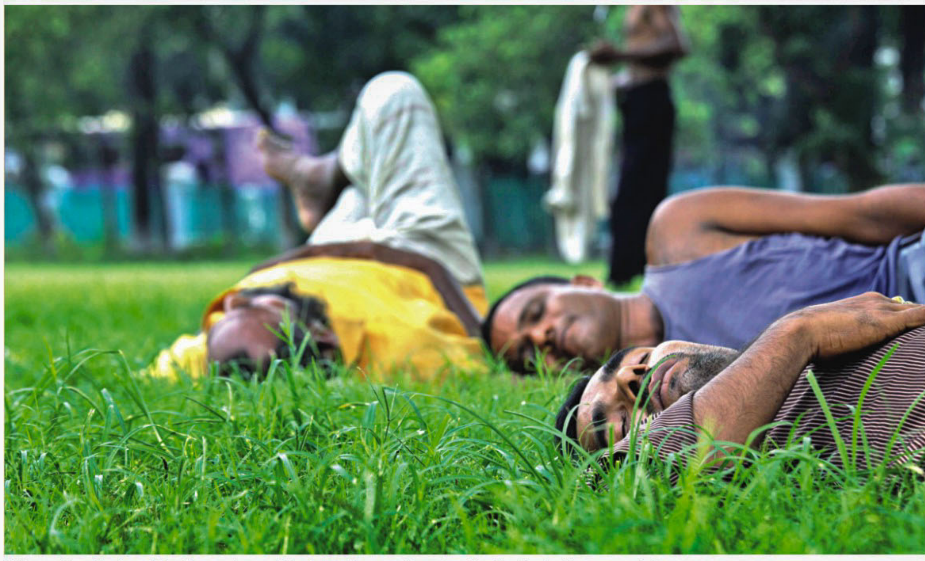
With no sign of rain and hardly any breeze blowing, a few people rest under the shade of a tree on Jatiya Eidgah Maidan in the capital yesterday before noon.