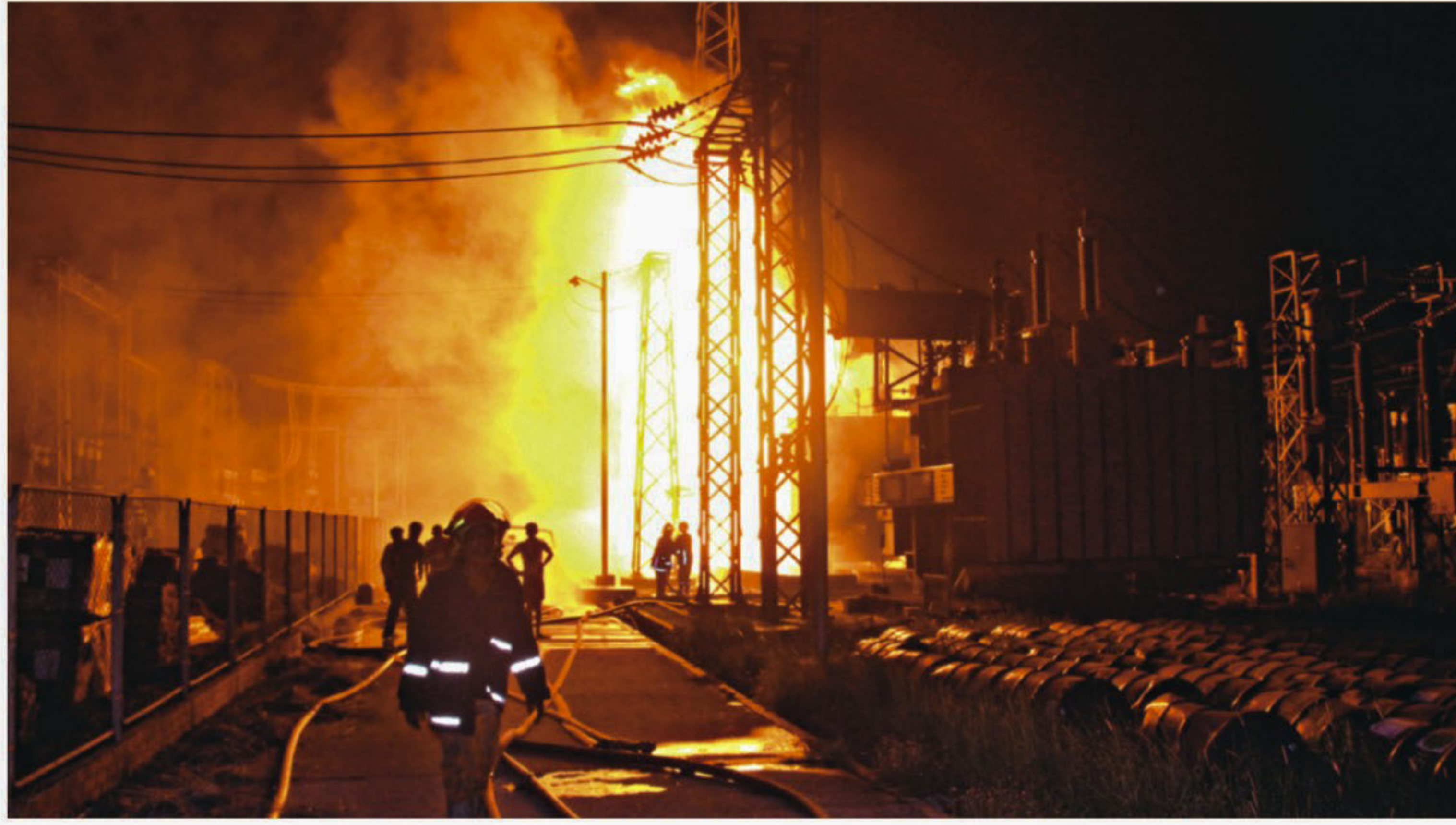
Firefighters trying to douse the huge flames at Hasnabad grid sub-station in Keraniganj on the outskirts of the capital last night.