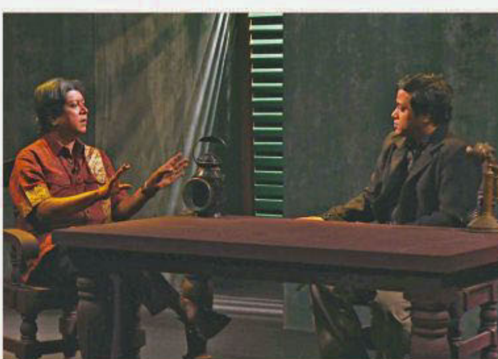
A scene from "The Hunt".