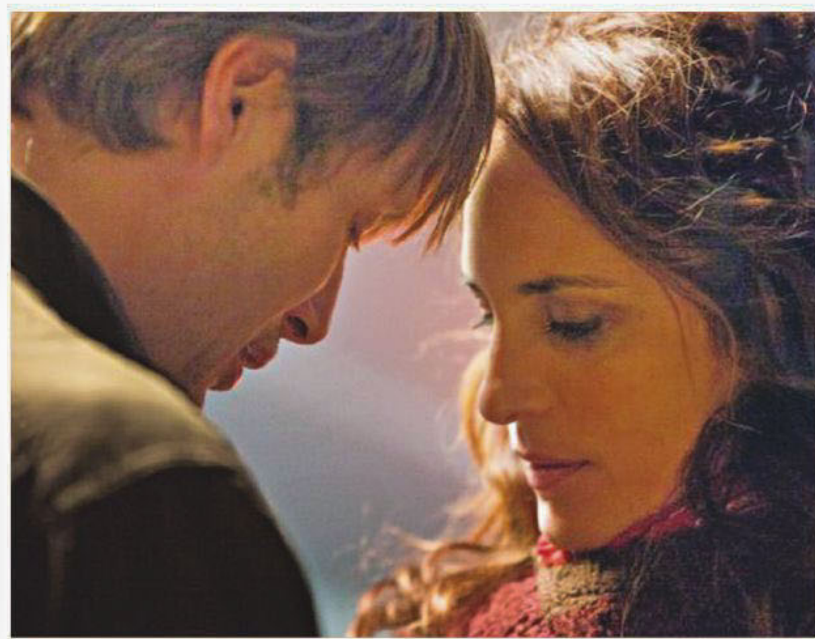
A scene from "The Hunt".

"In Denmark we have a saying that children and drunk people always tell the truth," he told reporters ahead of the red carpet world premiere in Cannes on Sunday. "Yes, we are claiming that this is not always the truth."