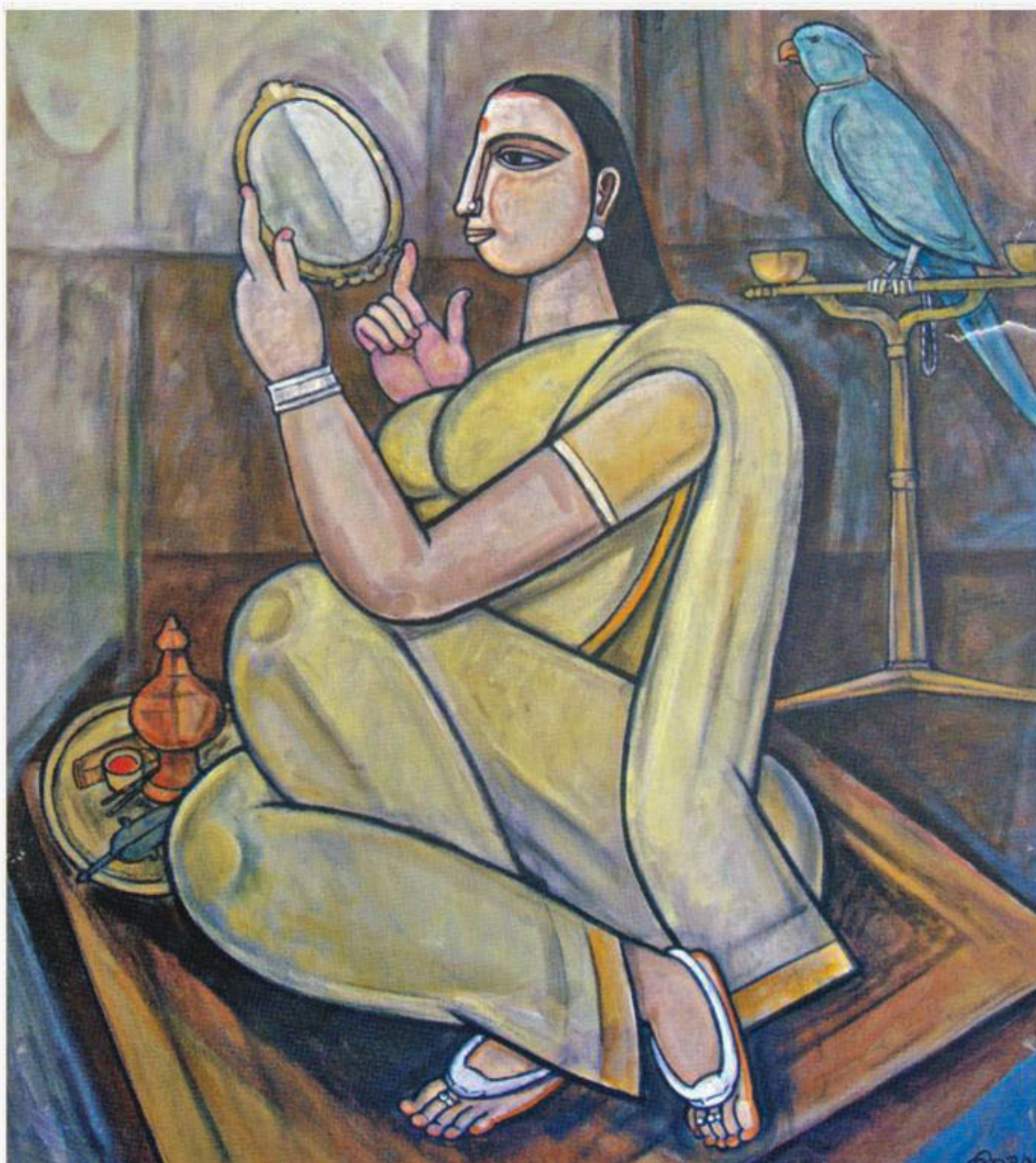
A painting by Bijan Choudhury.

A politically aware painter, his works are visual narratives. His strong mastery over lines never deteriorated into illustration. Most of his paintings are considered to be surrealistic and symbolic. Choudhury's artworks were exhibited extensively in India, Bangladesh, Germany, Sweden and other countries. He won many awards, which included the award from the Academy of Fine Arts in 1963 and the Rabindra Bharati Award in 1978.