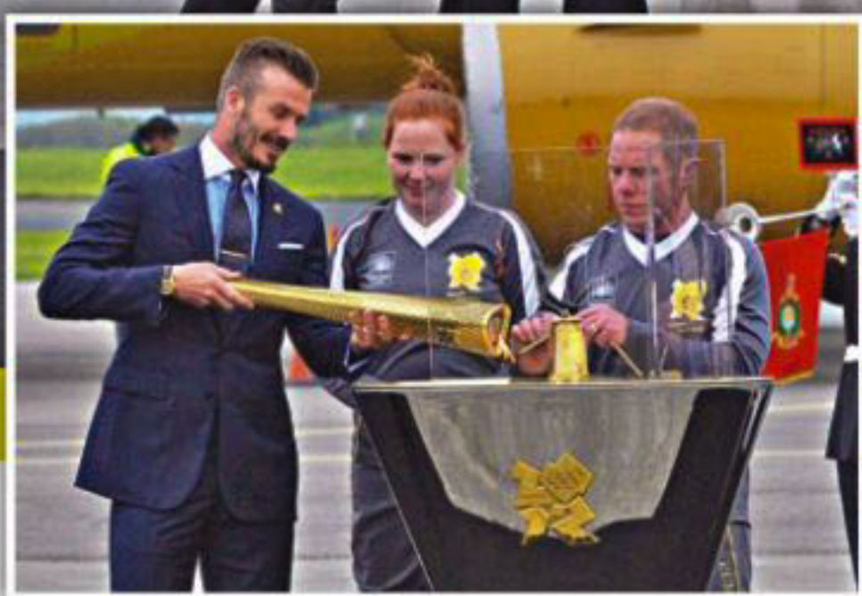
(Inset) London 2012 Olympic Games ambassador David Beckham lights the Olympic torch with a cauldron in Cornwall on Friday after (top) a British Airways special flight from Greece landed at the Culdrose naval air station.