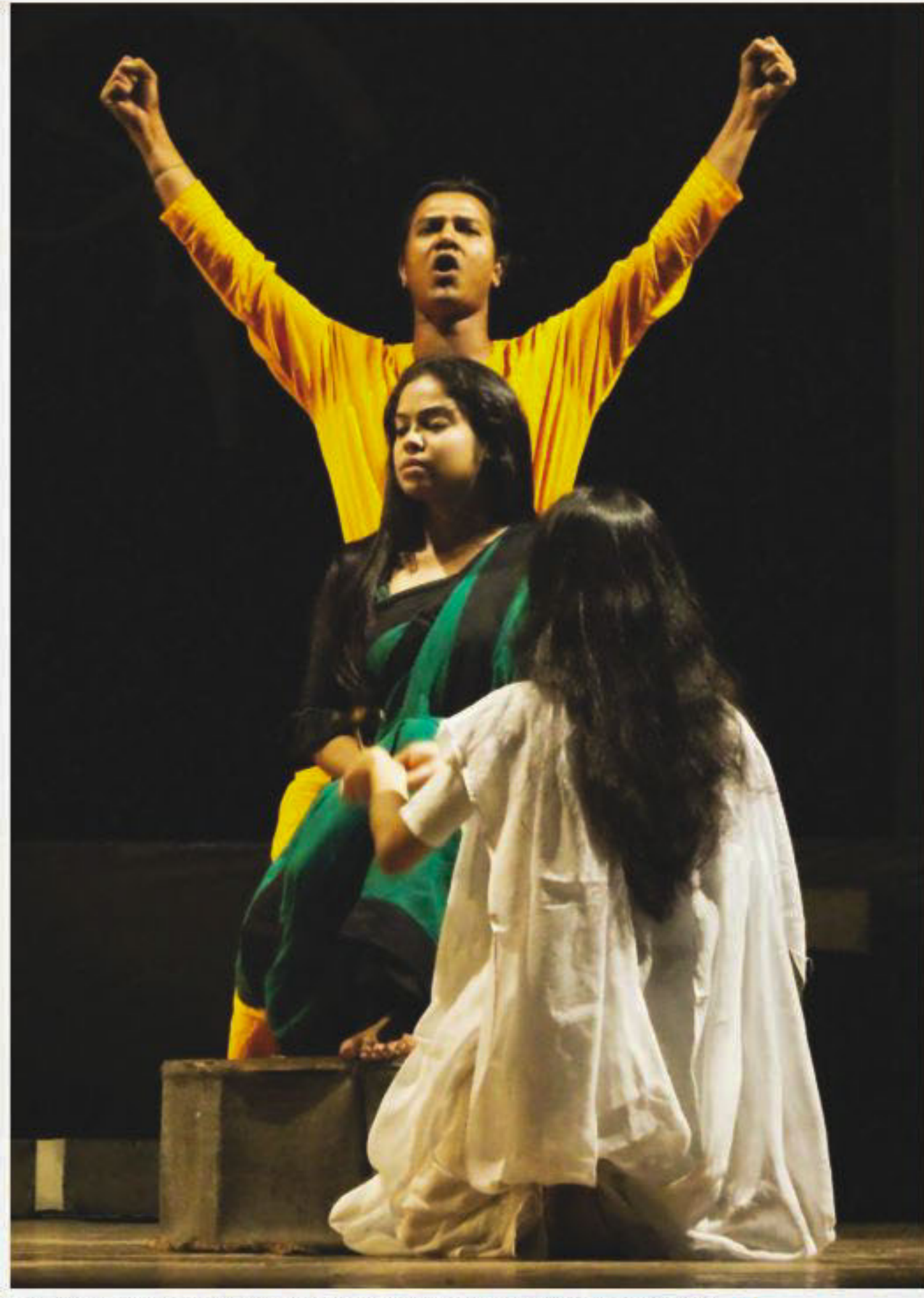
A feminist approach of mistreating a woman carries on symbolically throughout the play.