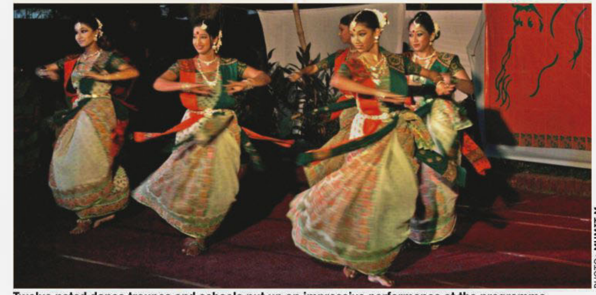
Twelve noted dance troupes and schools put up an impressive performance at the programme.