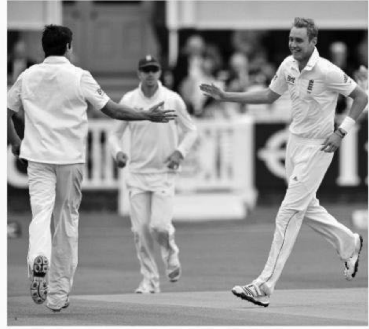
England fast bowler Stuart Broad (R) celebrates taking the last West Indian wicket during the second day of the first Test at Lord's yesterday.