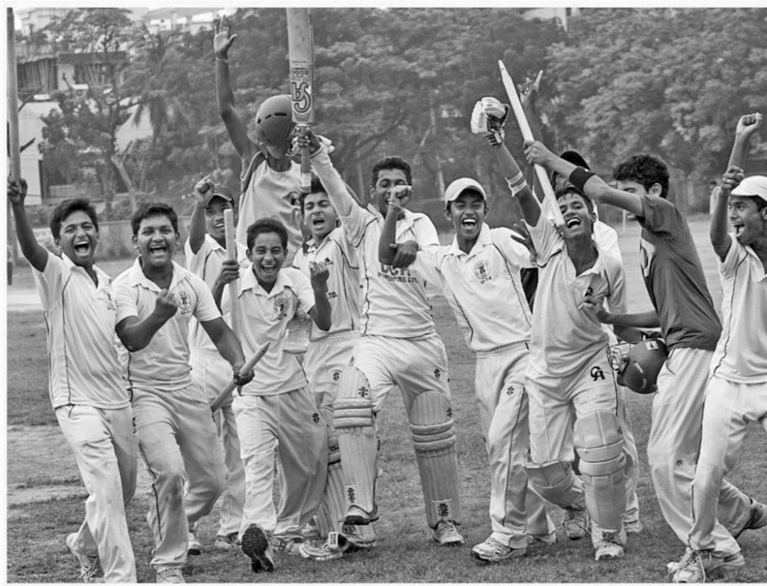
Chittagong players celebrate after winning the Young Tigers U-14 District Cricket Championship title beating Mymensingh by seven wickets in the final at the Dhamondi Cricket Stadium yesterday.

The women's 200m is shaping up as a duel between Jamaican Olympic champion Veronica Campbell-Brown and American Carmelita Jeter, the 100m world title-holder, in a preview of the two countries' rivalry at the Games.