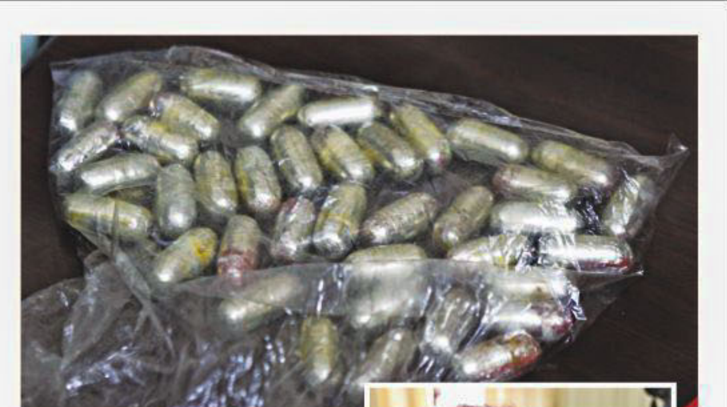
The Nigerian woman, inset, had swallowed 36 hard capsules containing cocaine to be smuggled into the country. She was arrested at a Banani hotel in the capital after she told the hotelier what she had done and that she was not feeling well.