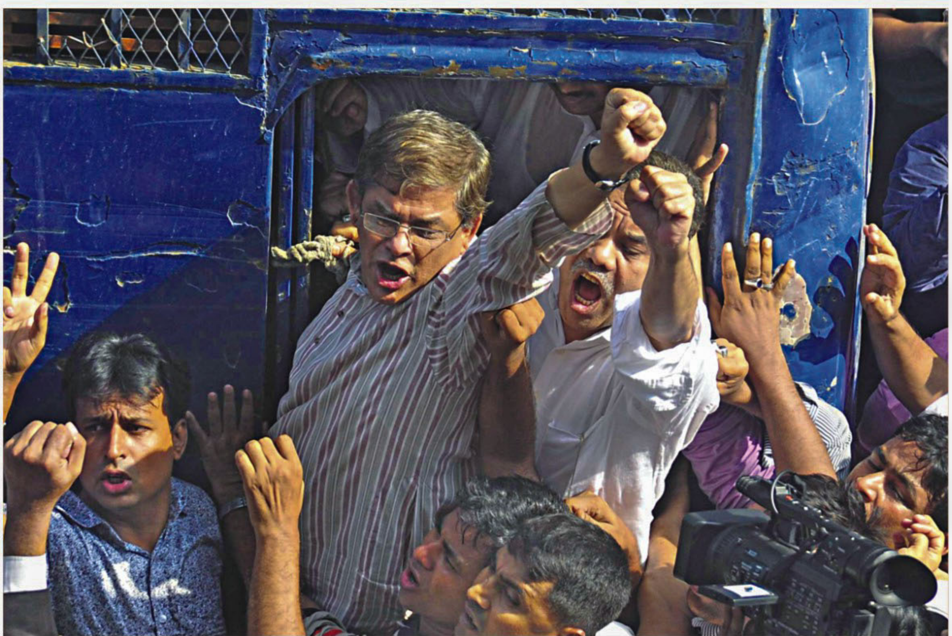
BNP acting secretary general Mirza Fakhru Islam Alamgir and party leader AKM Fazlul Haque Milon chant anti-government slogans as they board the prison van from a Dhaka court yesterday. This is the first time so many top opposition leaders were sent to jail at once by a court.