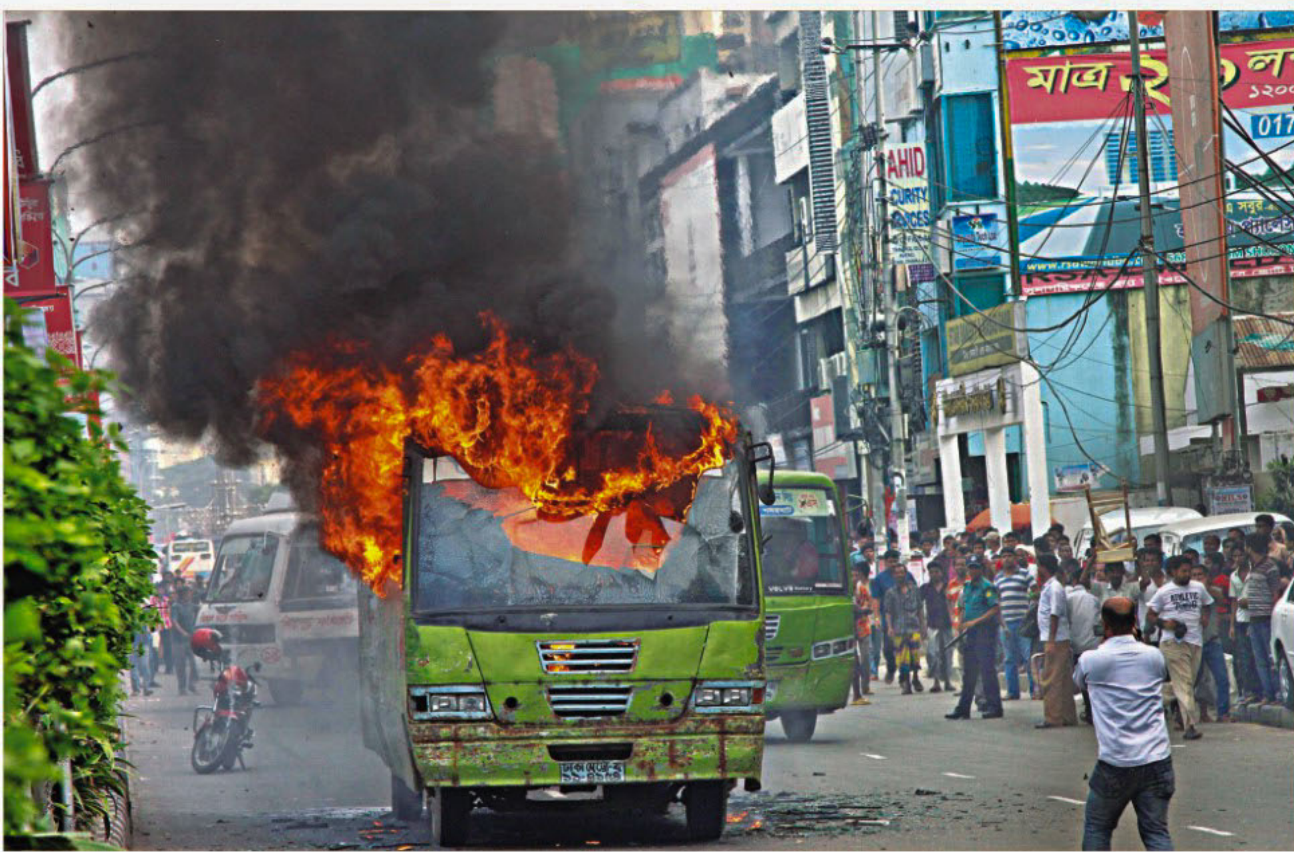
A minibus burns on Kazi Nazrul Islam Avenue at Karwan Bazar in the capital yesterday afternoon, hours after 33 top opposition leaders were sent to jail in an arson case.