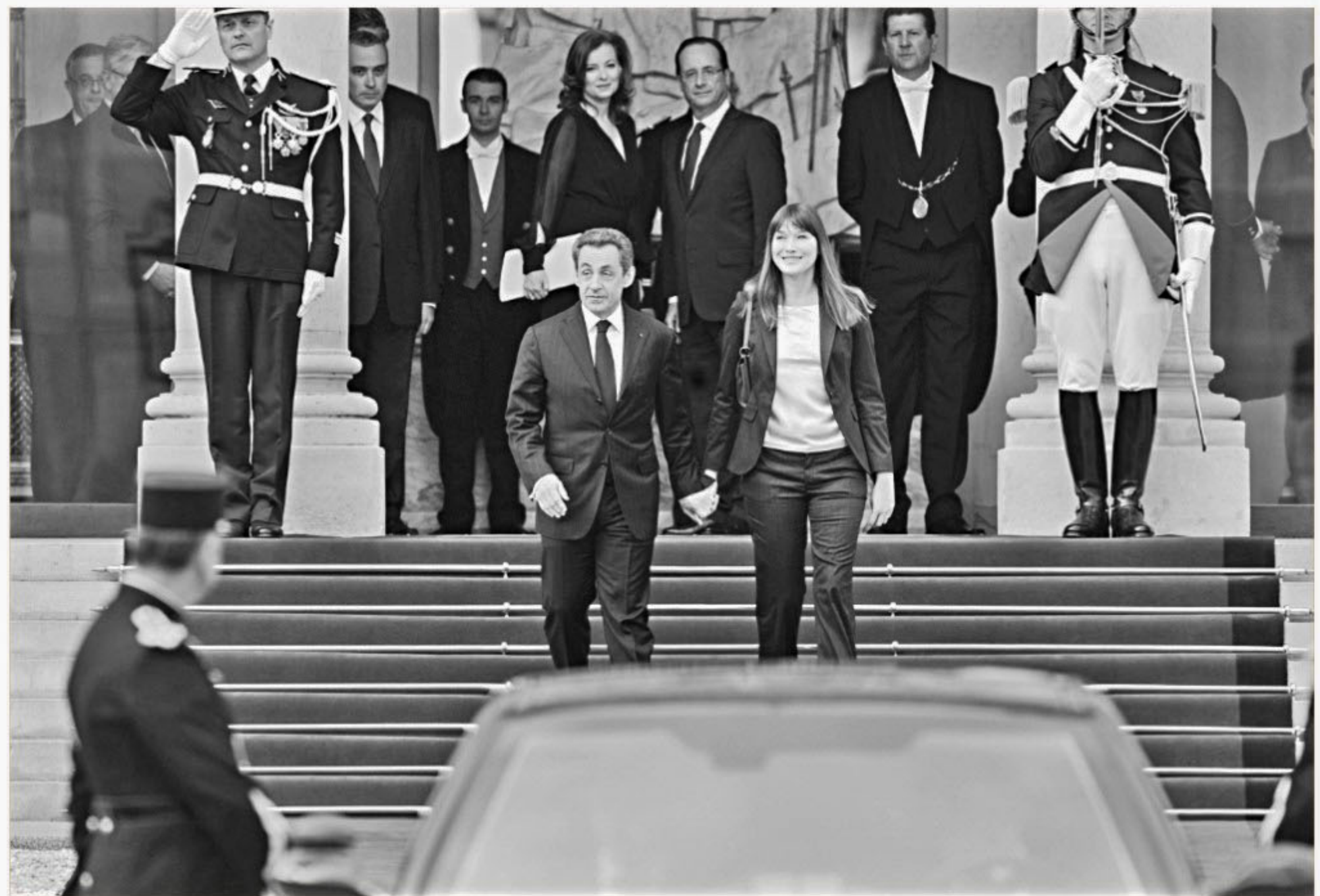
France's newly-elected President Francois Hollande and his companion Valerie Trierweiler watch France's outgoing president Nicolas Sarkozy and his wife Carla Bruni-Sarkozy leaving the Elysee presidential Palace after the formal investiture ceremony between France's president-elect Francois Hollande and his predecessor Nicolas Sarkozy yesterday in Paris.

After the talks with Merkel, Hollande heads to the United States where he is to meet President Barack Obama at the White House on Friday ahead of back-to-back G8 then Nato summits.