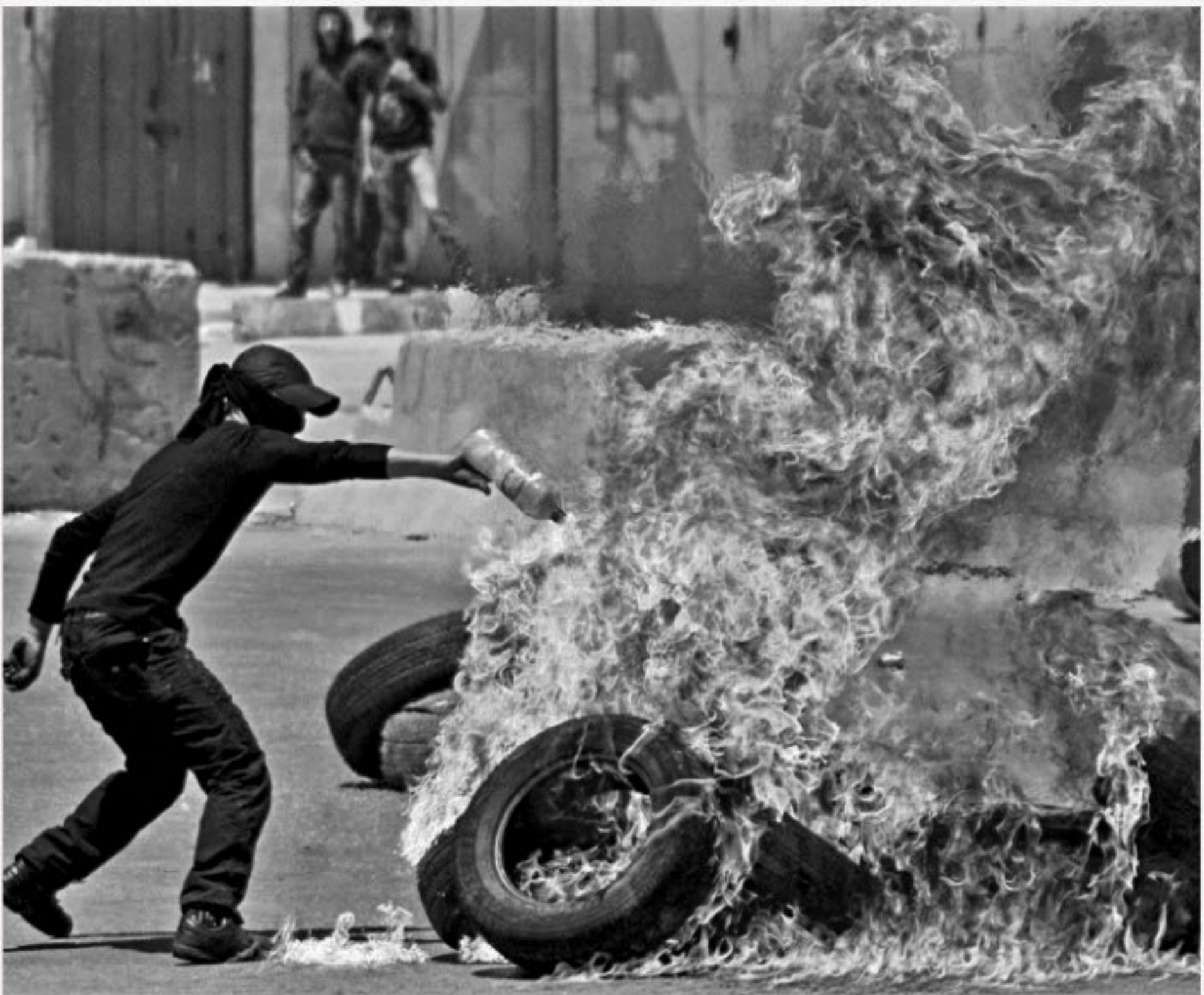
A masked Palestinian protester pours petrol on burning tyres during clashes at the Qalandia crossing in the occupied West Bank following protests yesterday, marking Nakba day, which commemorates the exodus of hundreds of thousands of their kin after the establishment of Israel state in 1948.

Figures on Tuesday showed the Greek economy slumped a massive 6.2 percent in the first quarter compared with a year earlier, leaving the country mired deep in recession for a fifth year.