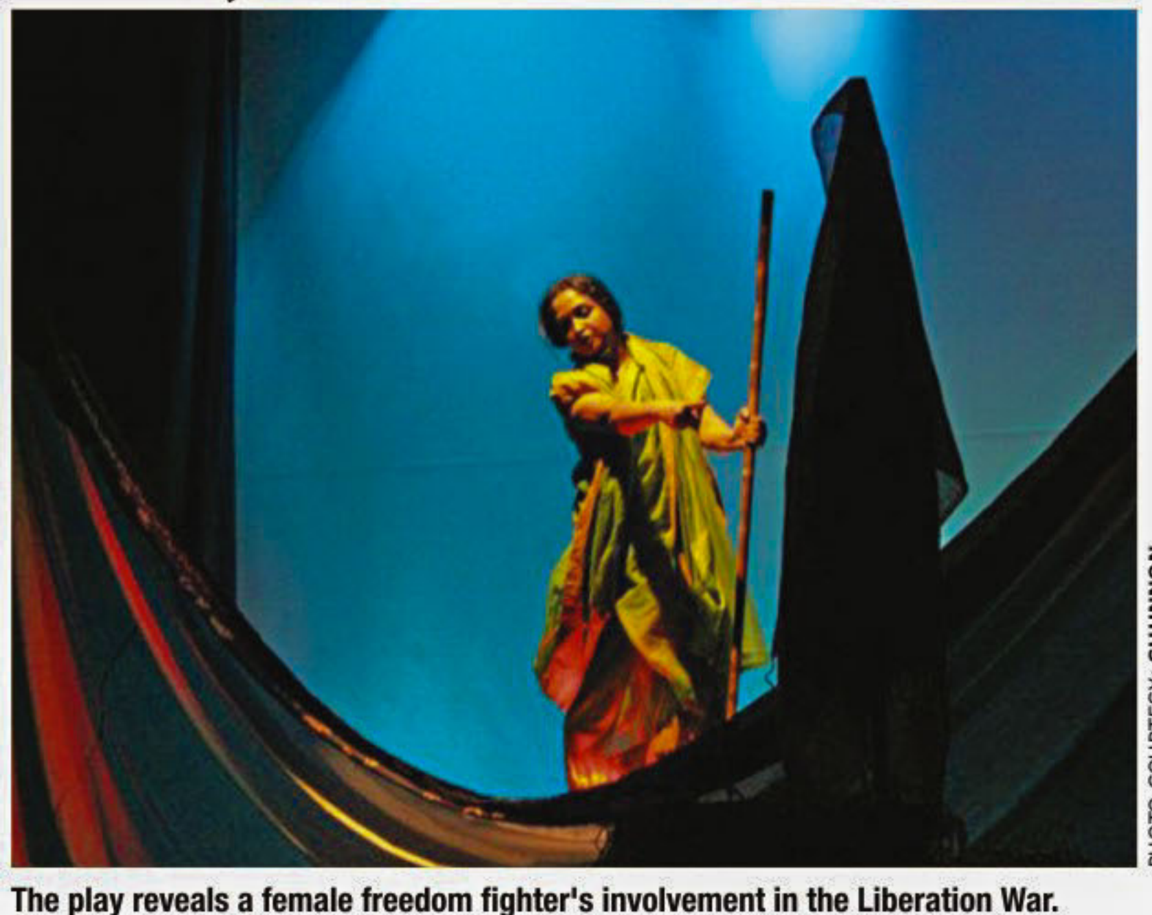
The play reveals a female freedom fighter's involvement in the Liberation War.

The play unfolds in a rural setting, zooming in on an adolescent and her carefree days. As the war breaks out, her father joins the freedom fighters. The young girl wants to do the same but her mother objects. Then one day, she meets a young man, whom she calls "an illusionist". The illusionist's spirit compels her to overcome all hurdles and join the pro-Liberation forces. But the girl, along with other freedom fighters, is captured by the Pakistani occupation forces. They engage her till the war is over. After four decades of independence, she asks the nation whether the spirit and values of the war have been upheld. Ramiz Raju and Julfikar Chanchal directed the music for the play. An added attraction is a flute recital by Bari Siddiqui.