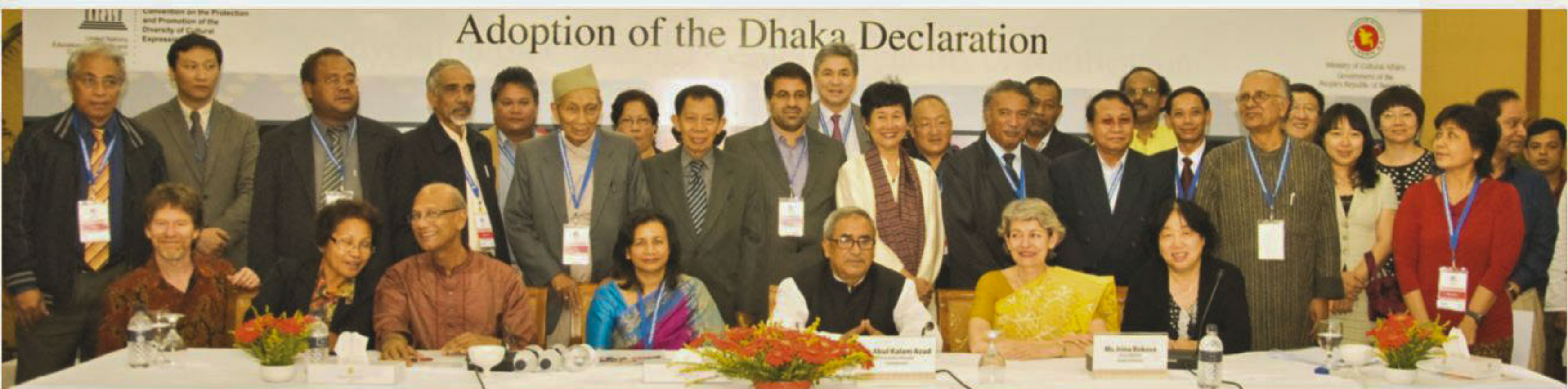
Apart from other issues, the Forum focused on how to create a space for the civil society groups to play active roles for development.