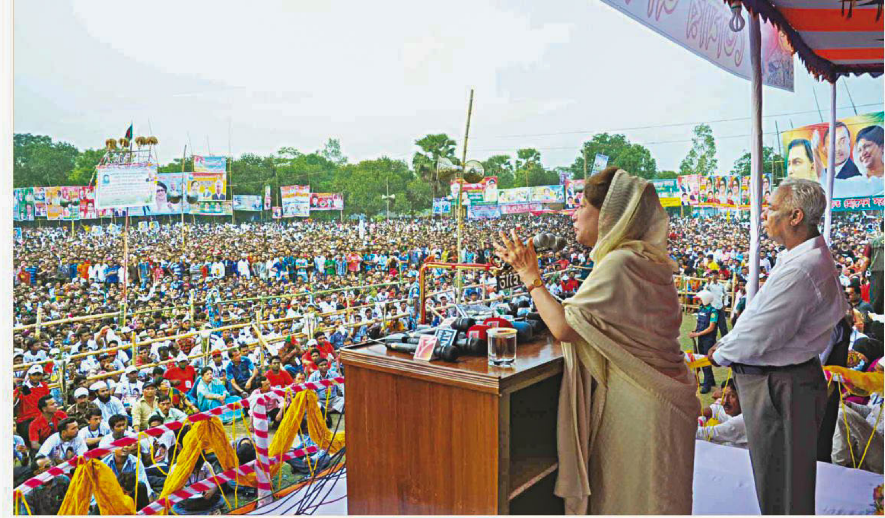
Leader of the Opposition in Parliament and BNP Chairperson Khaleda Zia addresses a rally at Chala Club playground in Gazipur yesterday. (Story on Page 20)