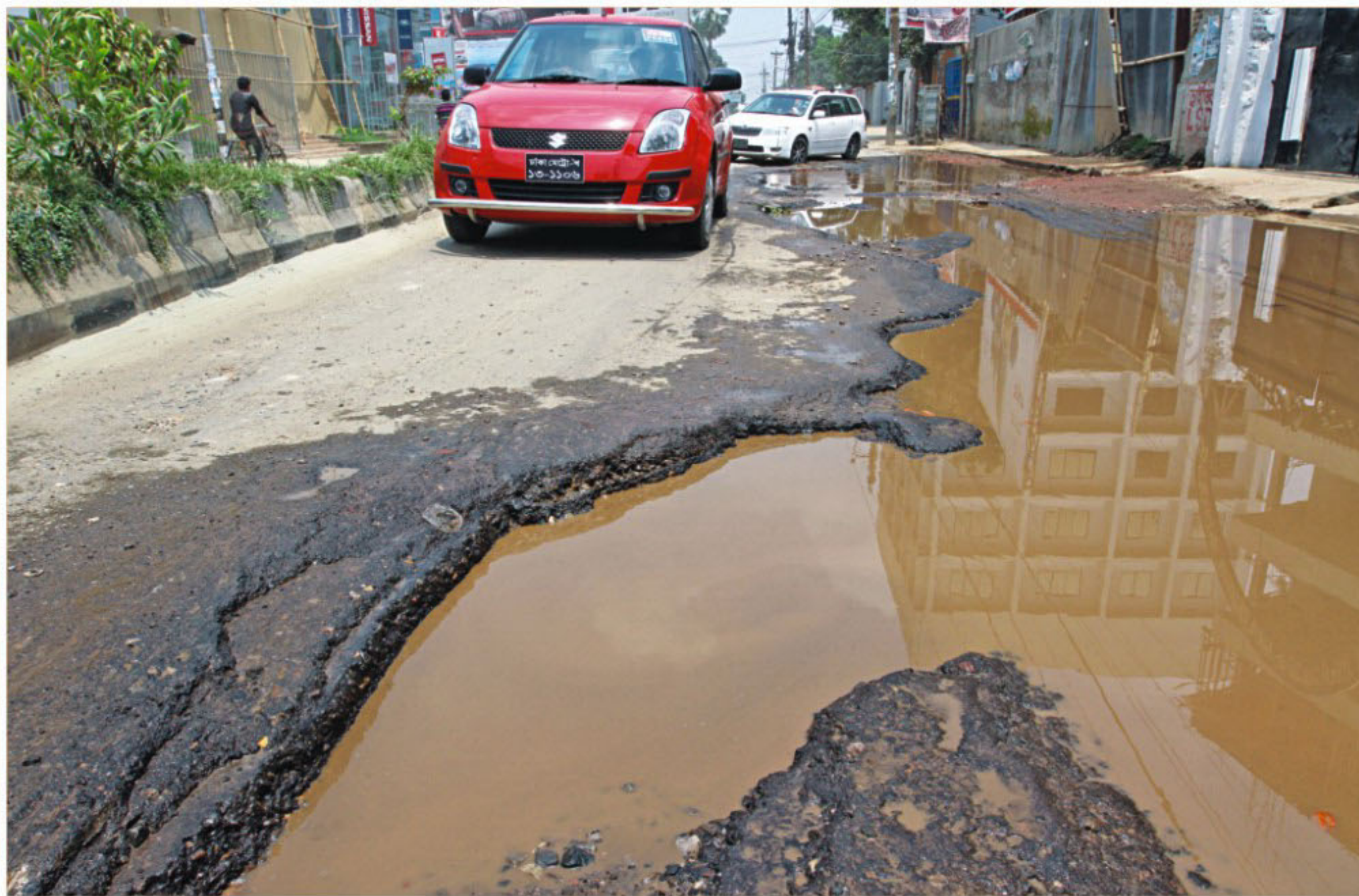
Huge chunks of tarmac have gone missing from this road connecting Tejgaon to Gulshan 1 in the capital while pools of sewage hide the depths of the holes, leaving commuters battling to get across. The photo was taken yesterday.

A case was filed with Iswarganj Police Station in this regard.