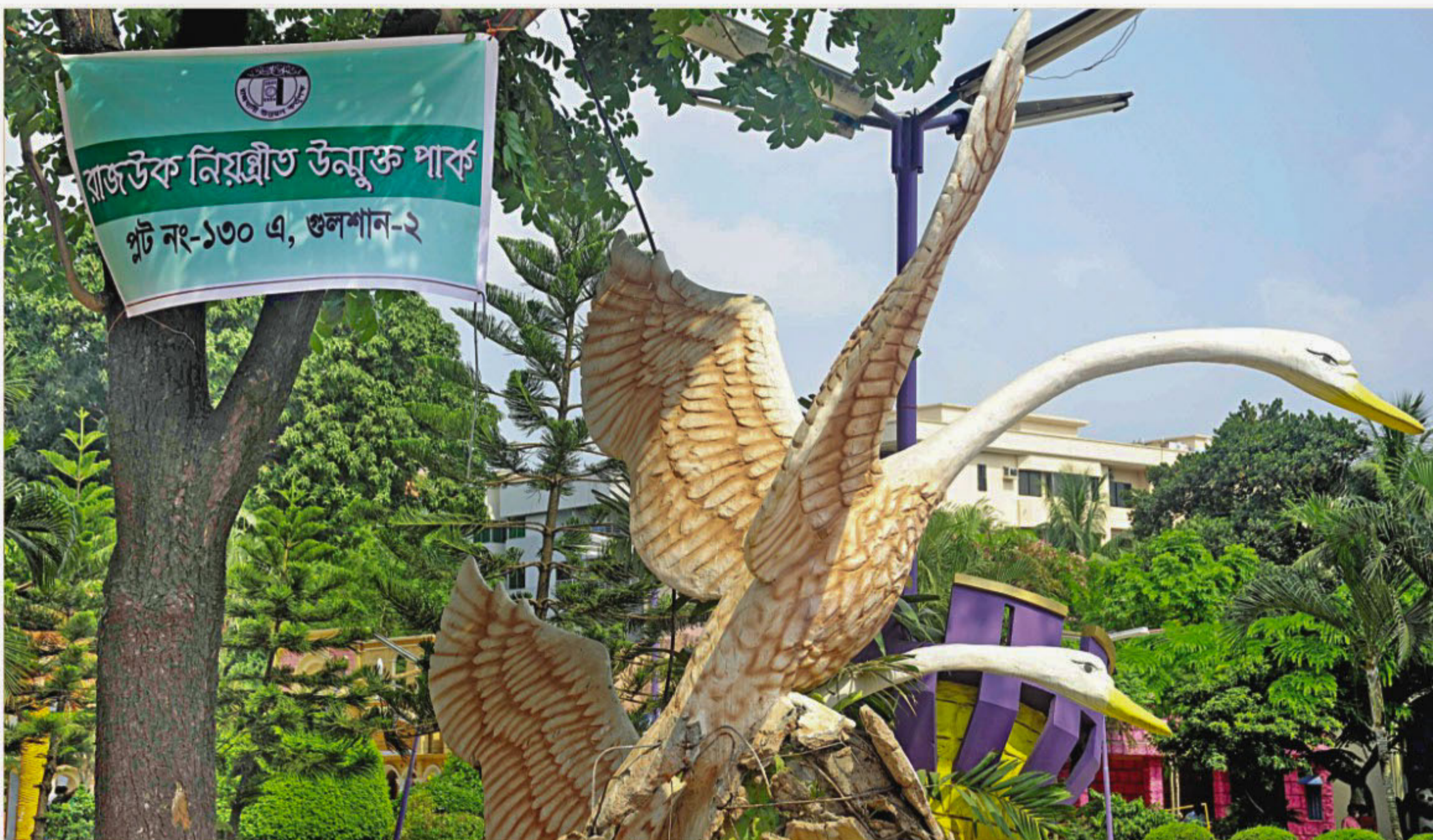
Rajdhani Unnayan Kartripakkha (Rajuk) hangs up a notice yesterday declaring the plot, once housing Wonderland amusement park, as a public park of the capital. Rajuk demolished the main entrance and boundary wall of the park on Monday to free around four acres of land of Gulshan central playground following what they said was a Supreme Court verdict.